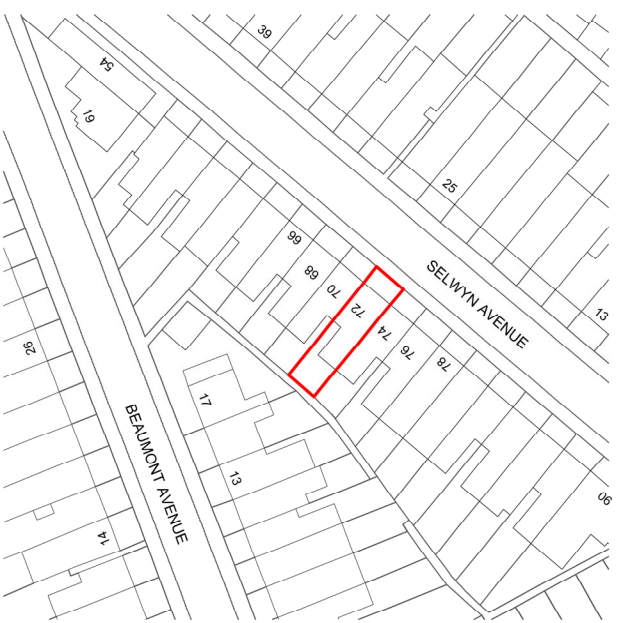
01 | LOCATION PLAN 1:1250