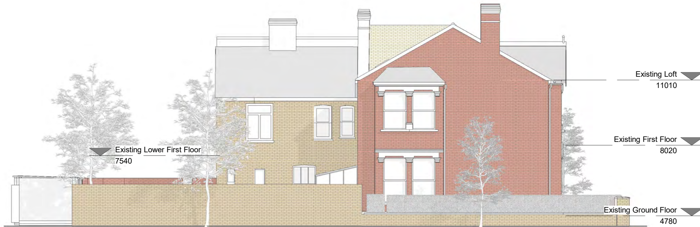
1 Existing Side Elevation - Street (SW) 1 : 100