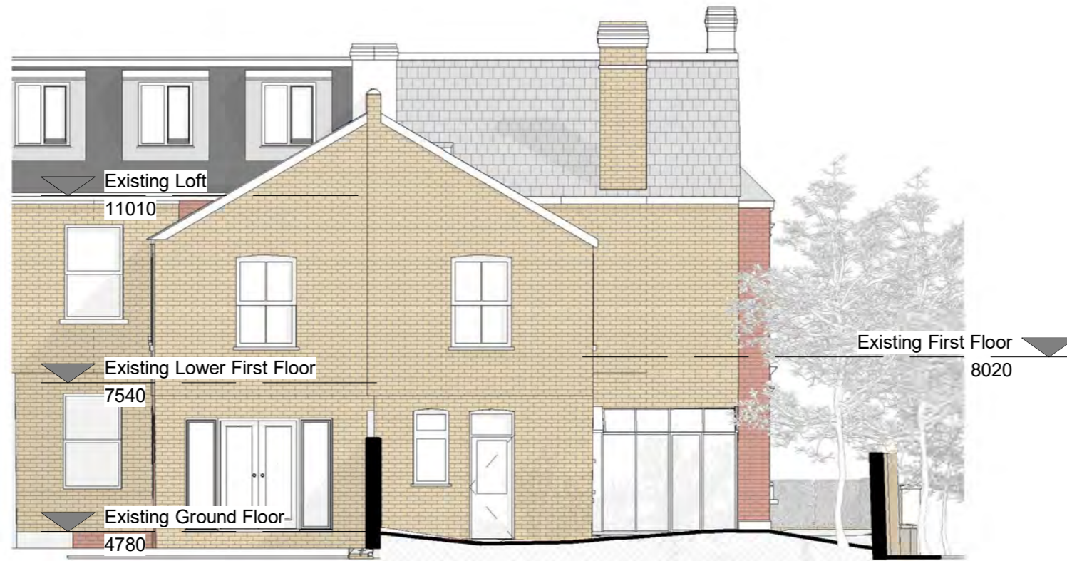
1 Rear Elevation (NW)