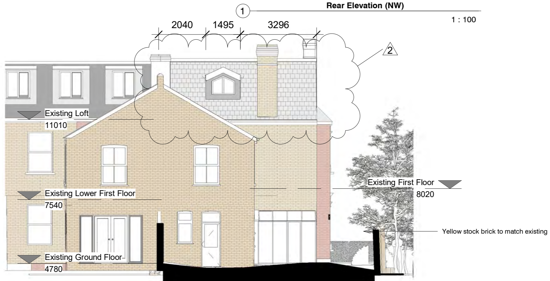
2 Proposed Rear Elevation (NW)