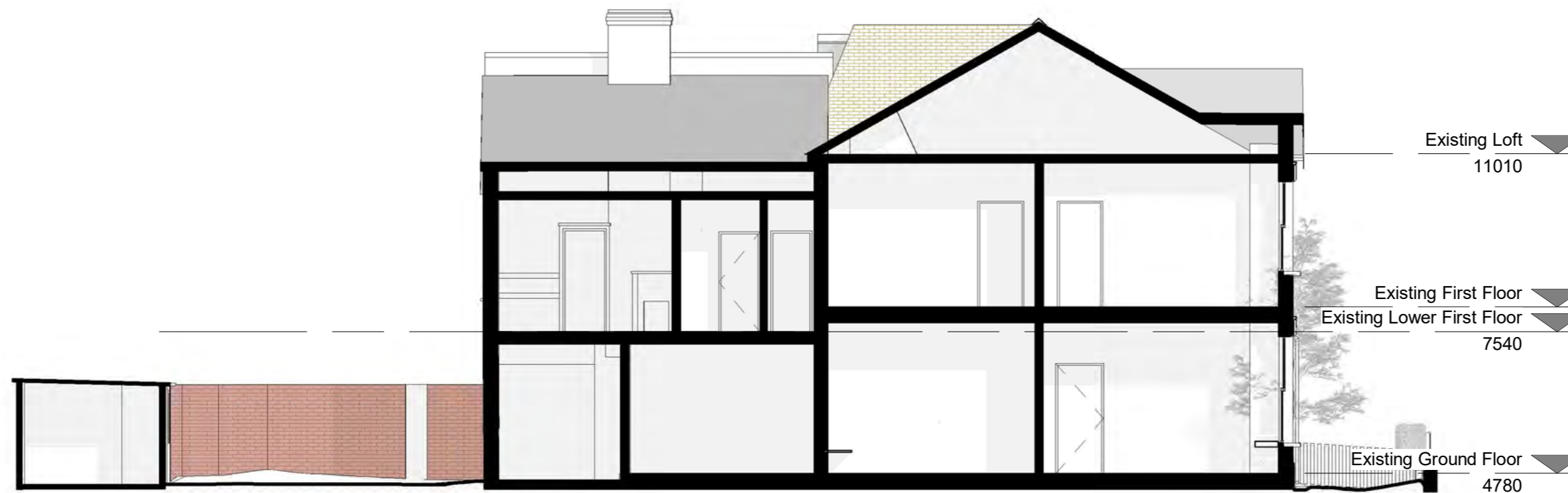
Existing Section 1 1 : 100