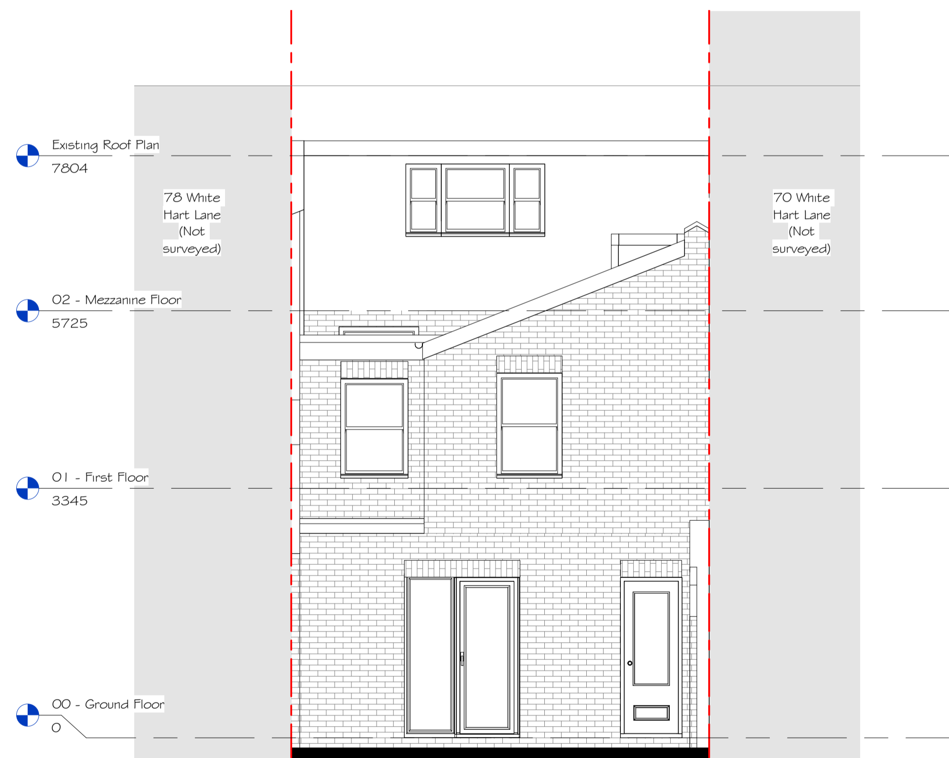
3 Existing Rear Elevation 1 : 50