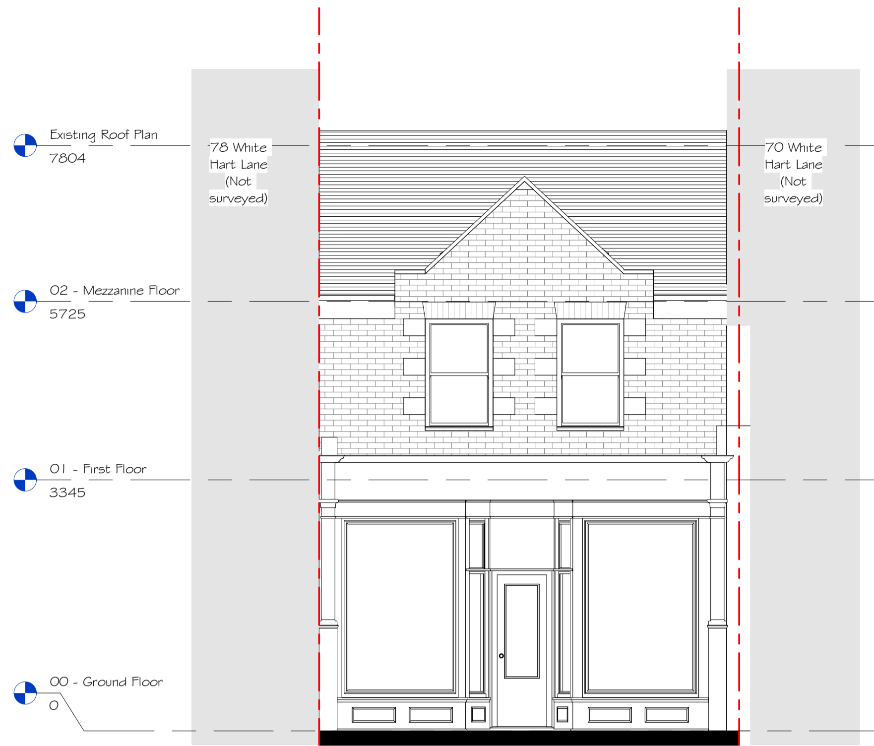
4 Existing Front Elevation 1 : 50