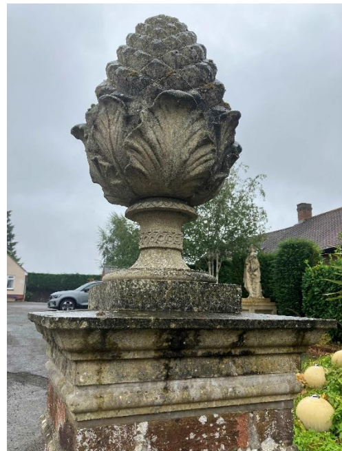
Existing pineapple to the inner gate at Doughty House adjacent to 144 Richmond Hill