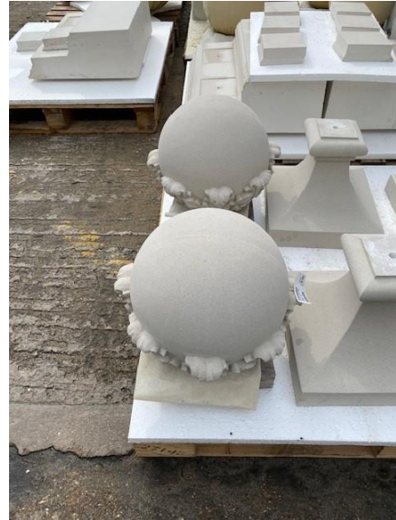
Examples of Haddonstone lightly textured cast stone finishes.