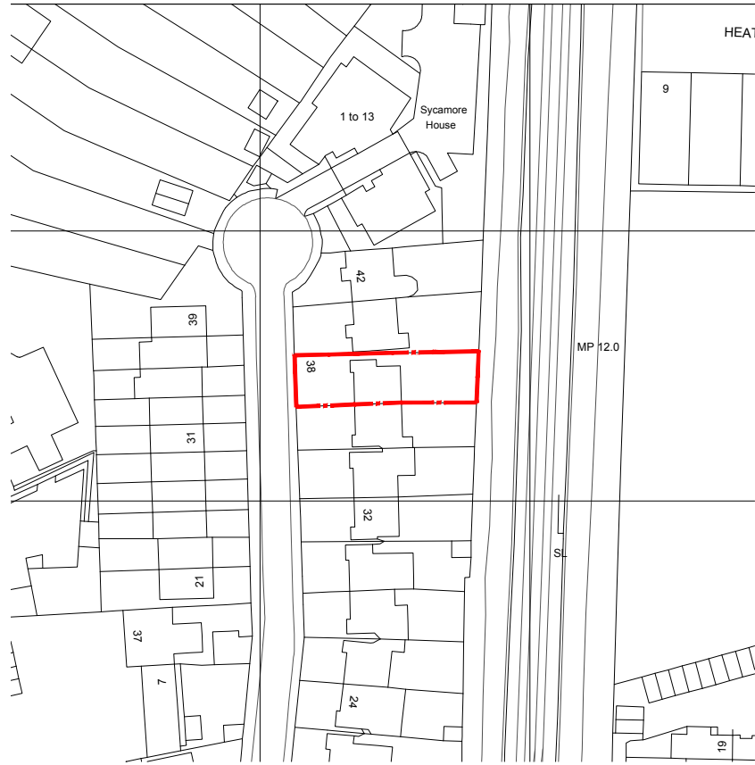
SITE LOCATION PLAN SC 1:1250