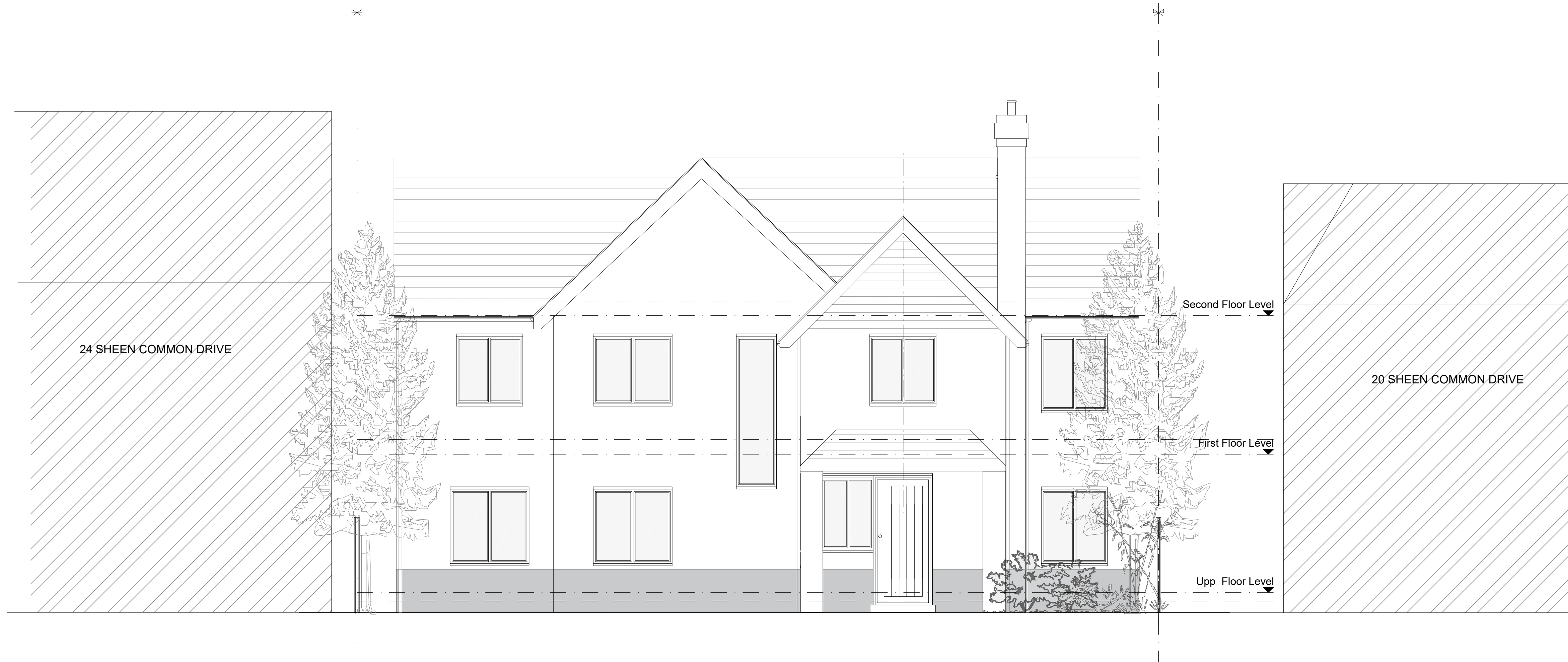
01 Front Elevation - EXISTING scale 1:50