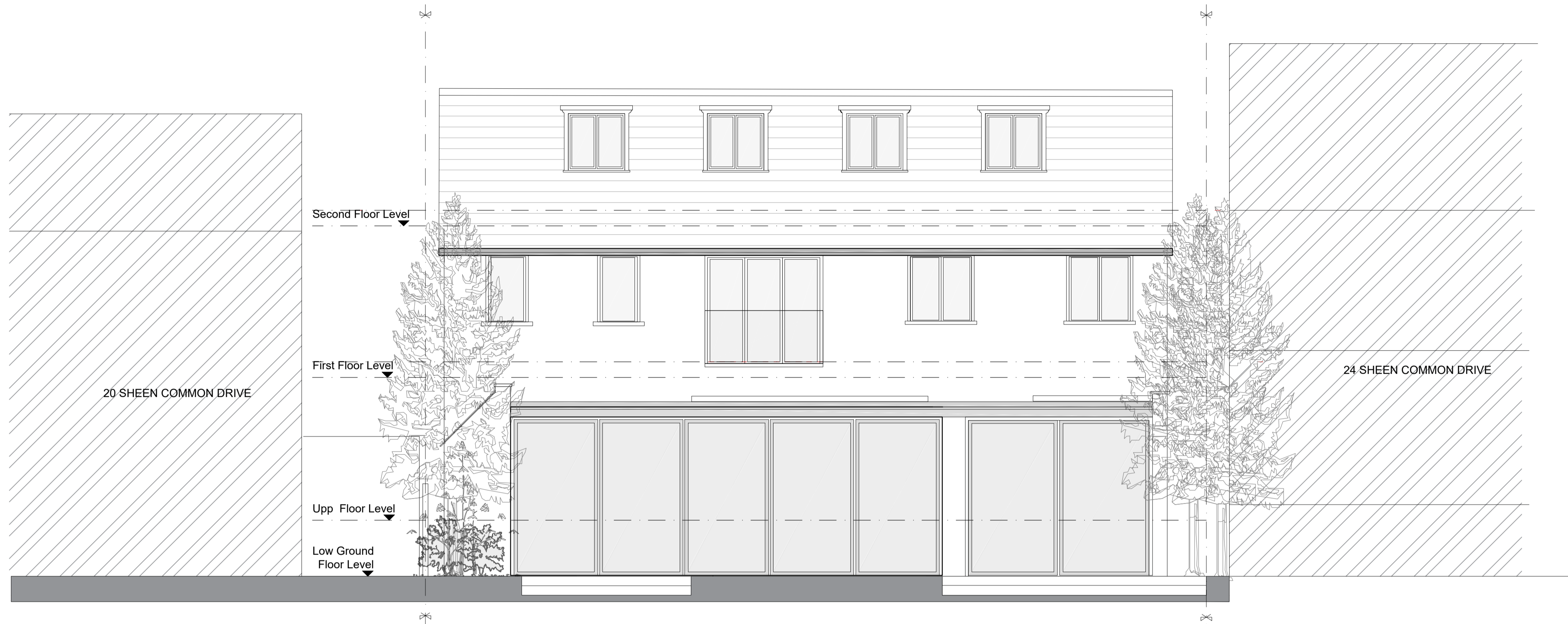
01 Rear Elevation - PROPOSED scale 1:50