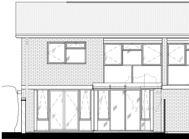
1 Elevation-West-Existing CLD