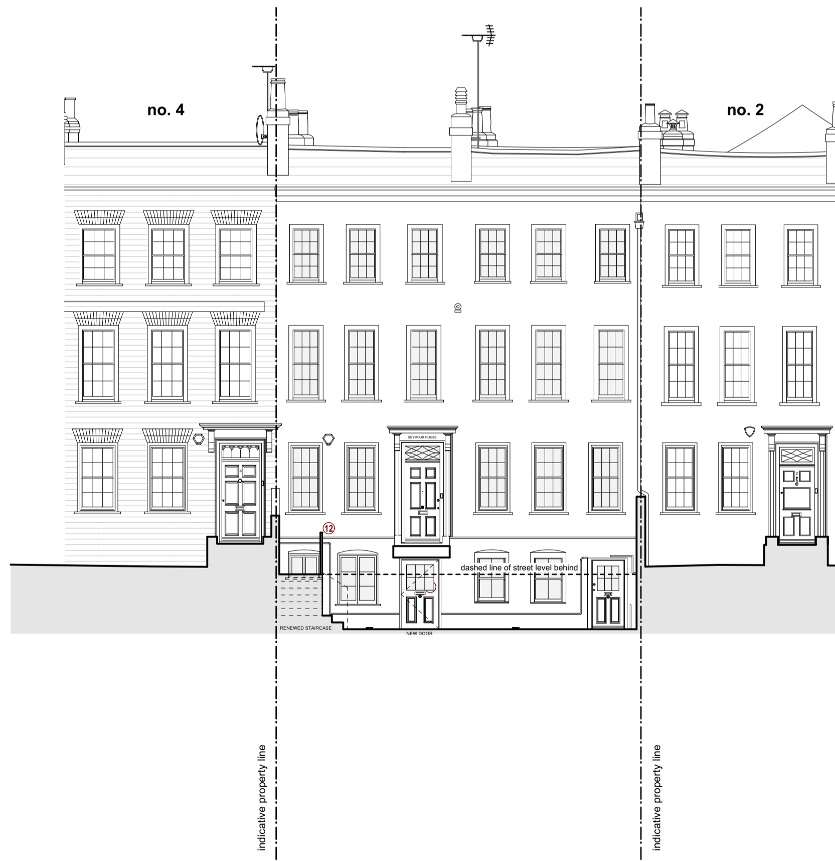
1 Proposed Front Elevation - Basement Level Scale 1:100