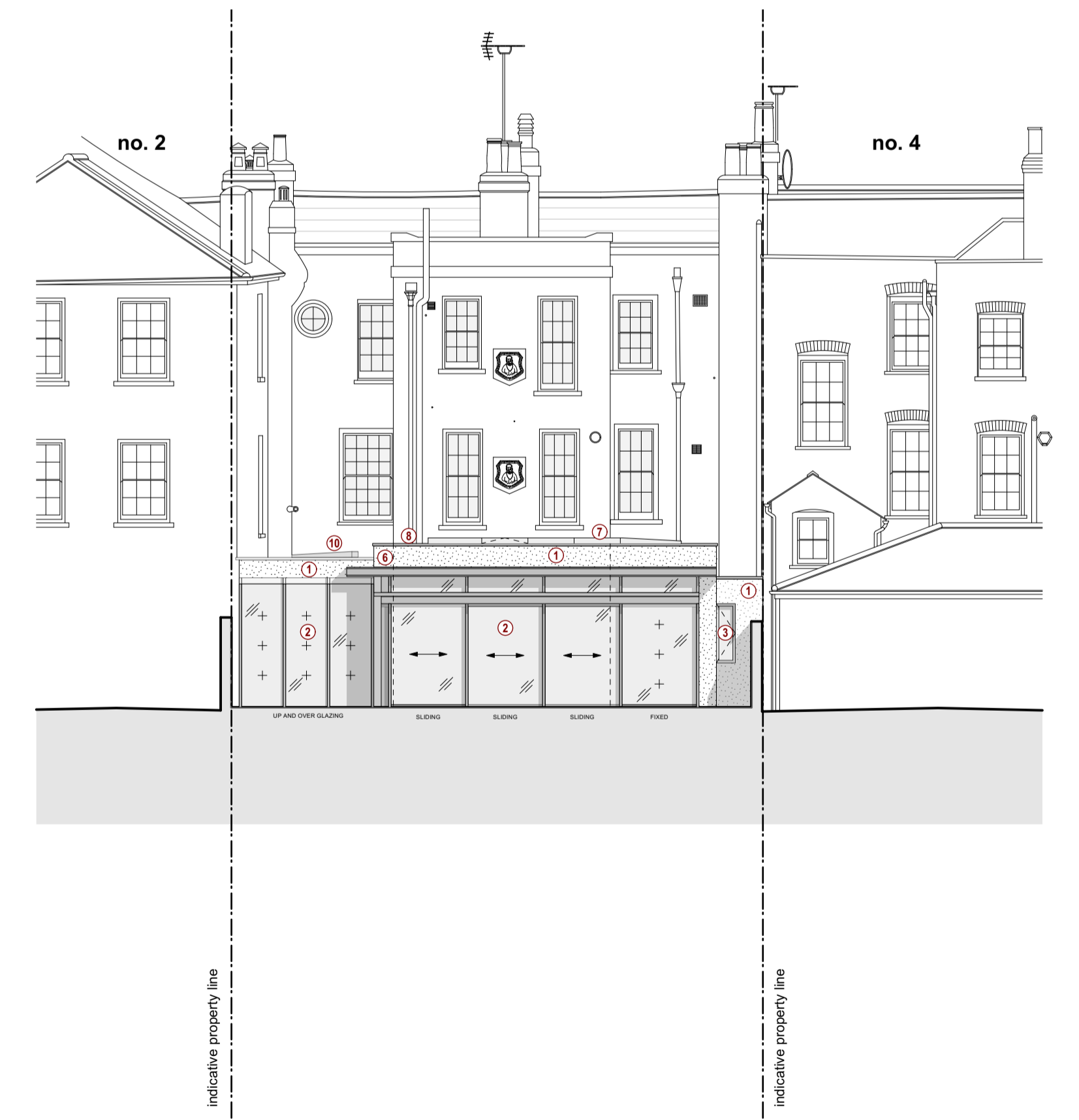
3 Proposed Rear Elevation Scale 1:100