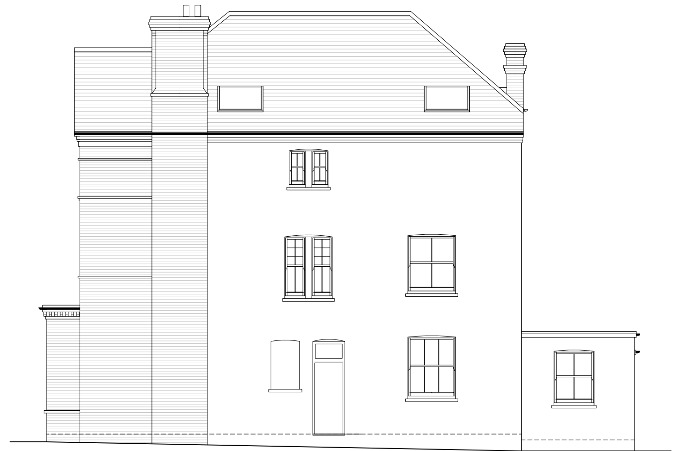
EXISTING SIDE ELEVATION 1:100