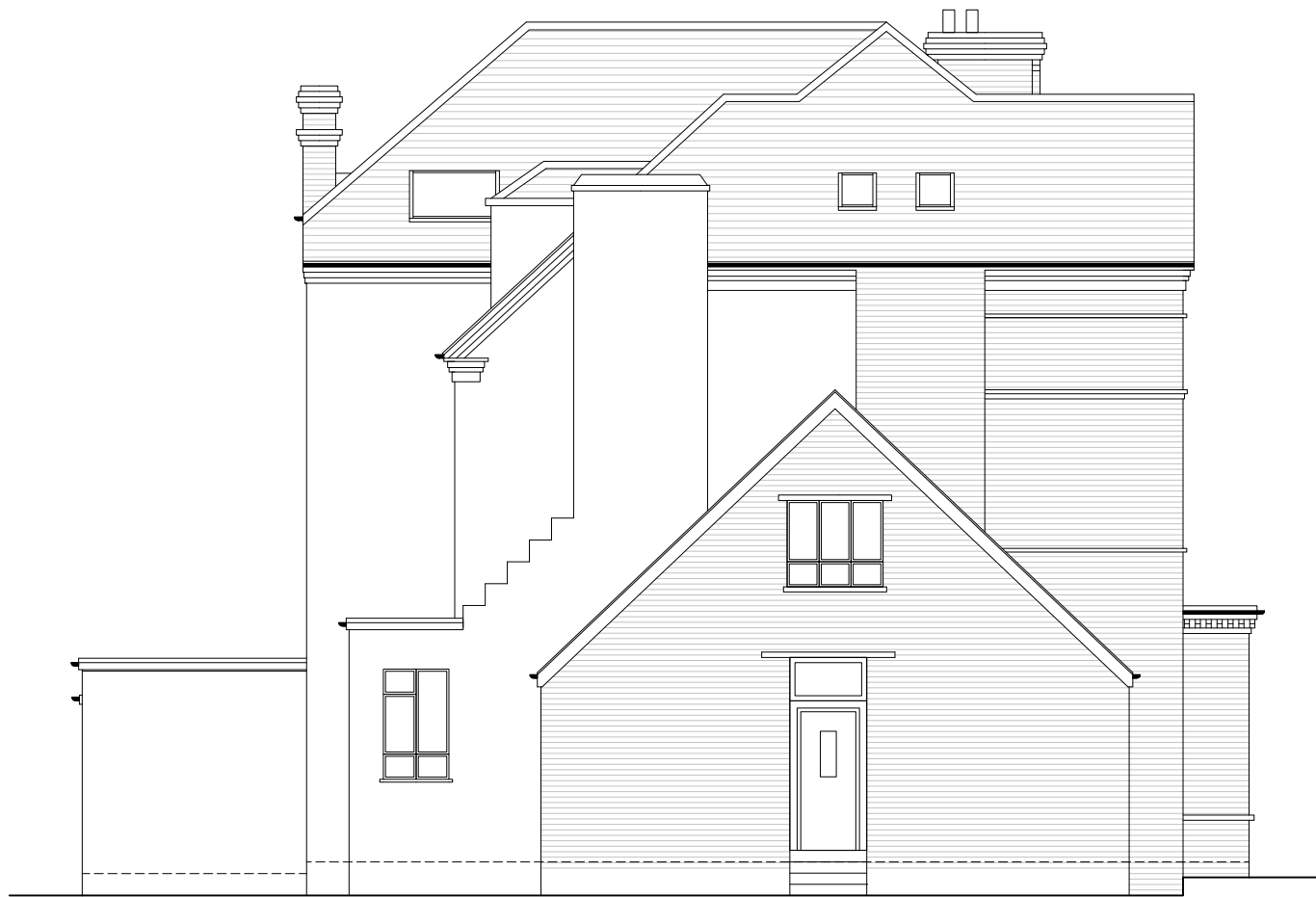
EXISTING SIDE ELEVATION 1:100