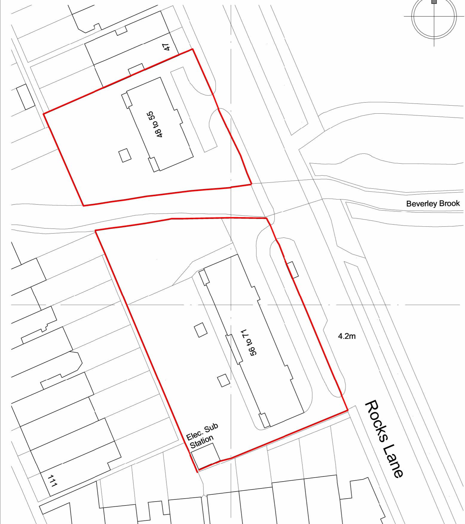
Freeholder Legal Boundary (Title Plan TGL 181711)