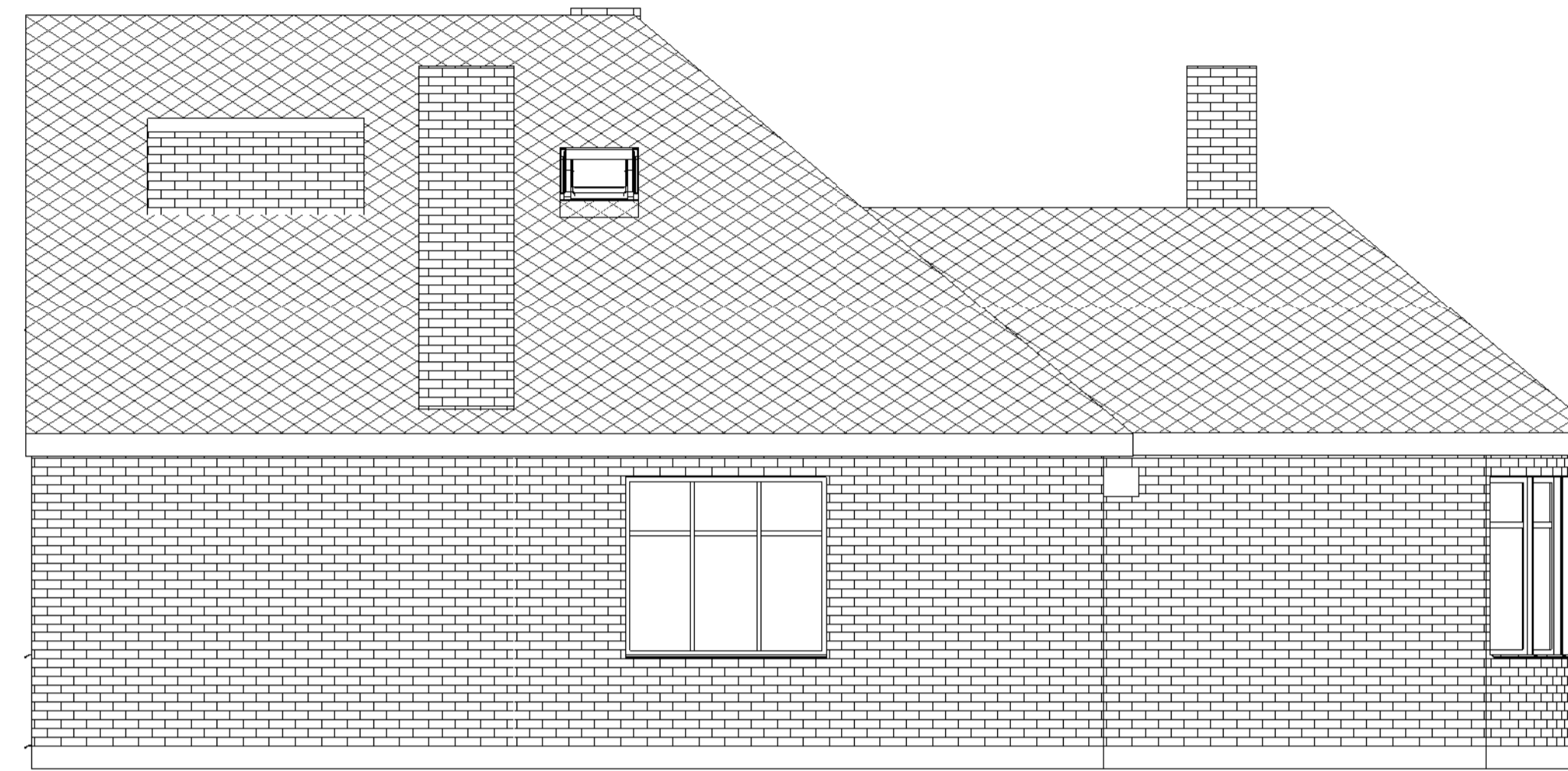
3 Existing West Elevation 1 : 50