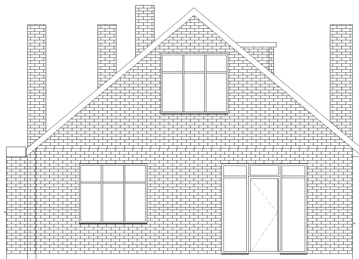
2 Existing Rear Elevation 1 : 50