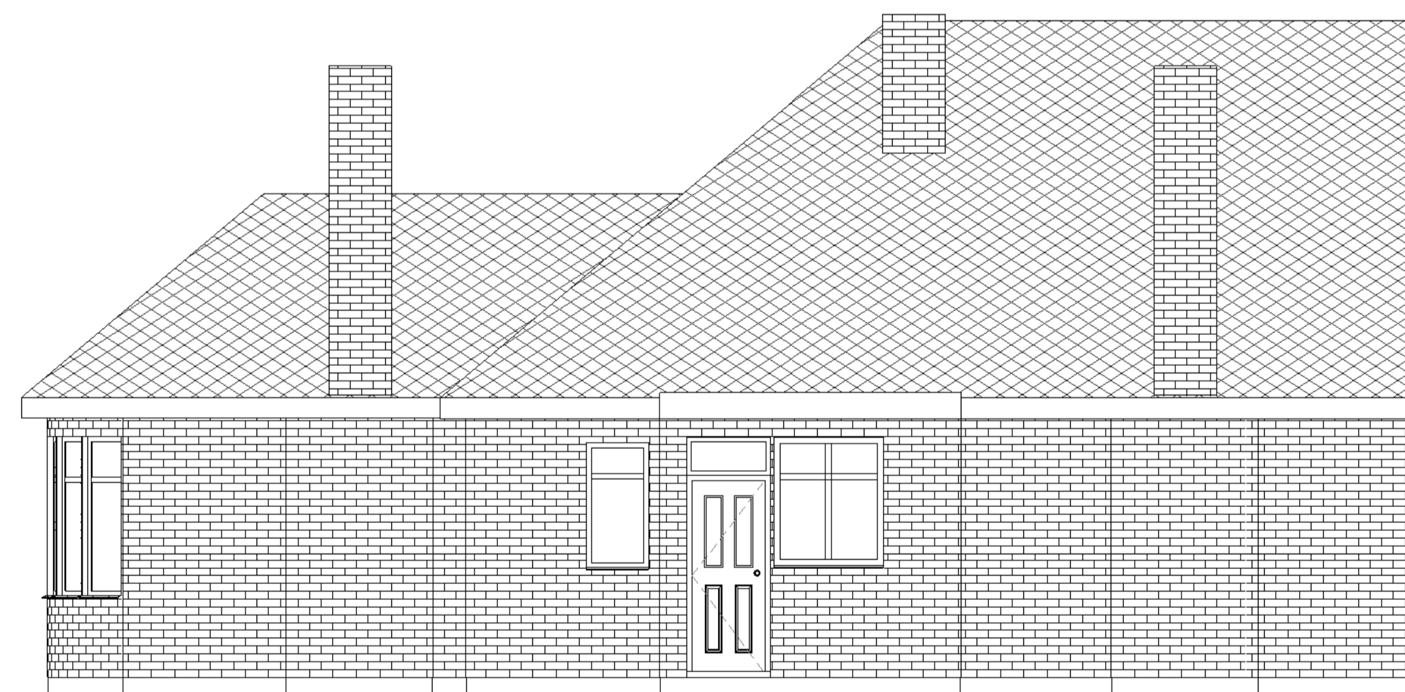
4 Existing East Elevation 1 : 50