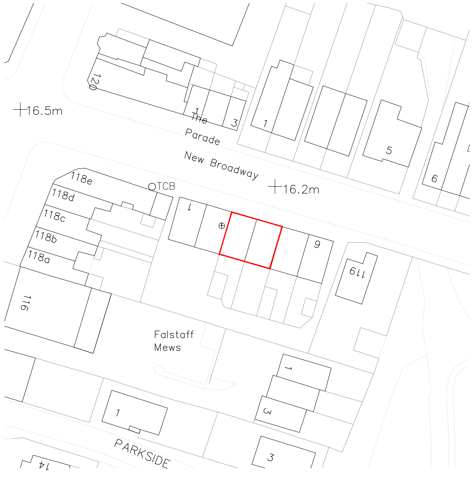
SITE LAYOUT PLAN Scale 1:500