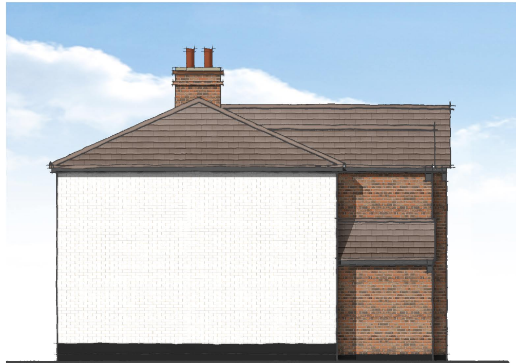
Side Elevation May Road