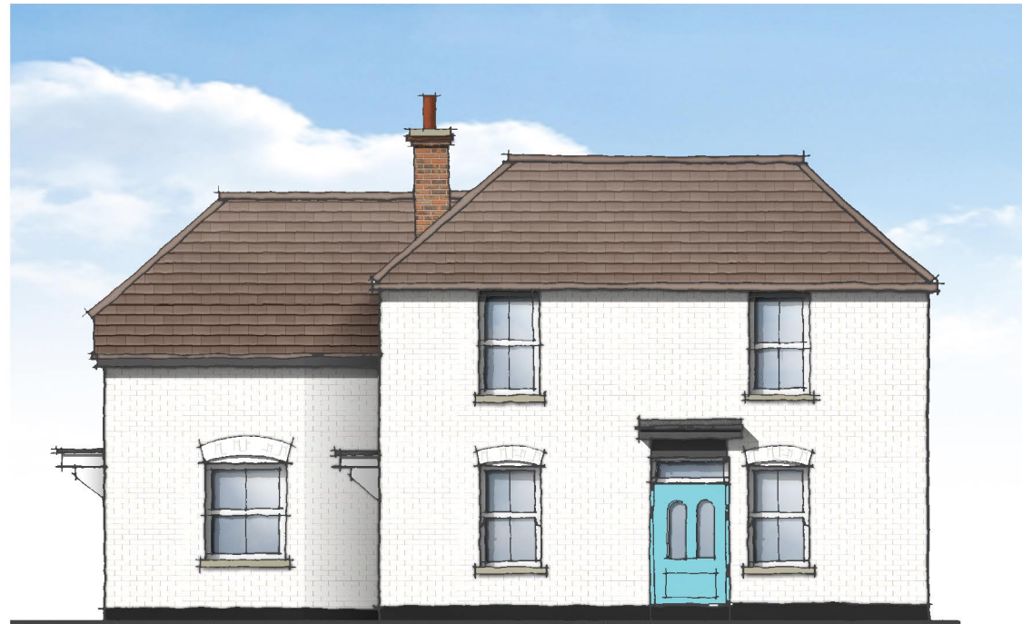
Front Elevation The Green