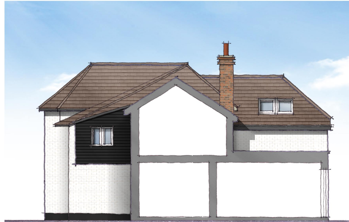
Rear Elevation The Green