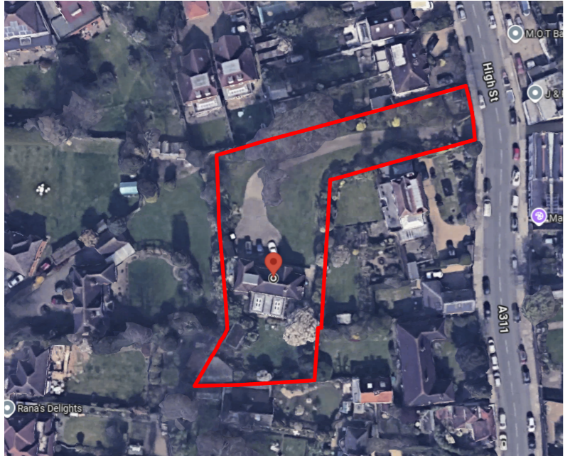
Aerial View NOT TO SCALE