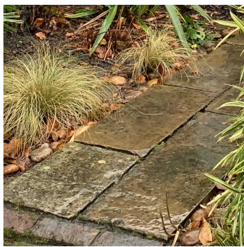
RE-LAYING EXISTING PAVING