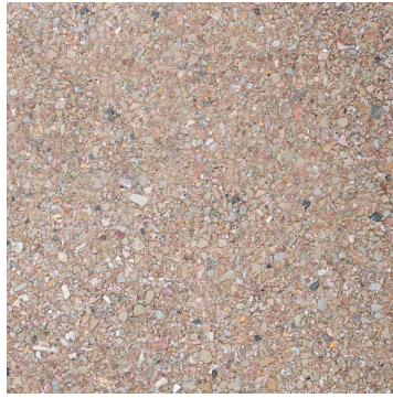
SELF BINDING GRAVEL