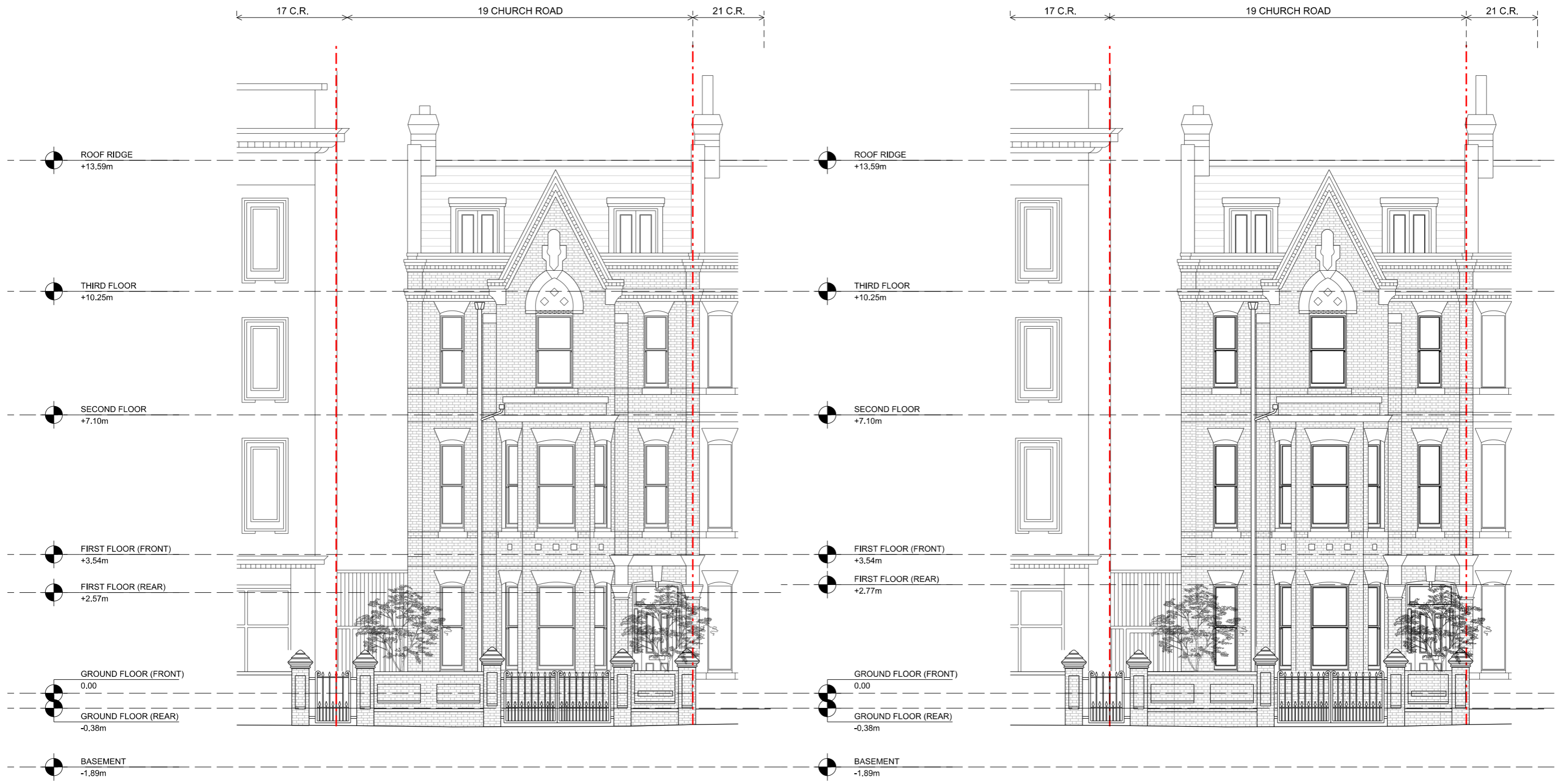
01 EXISTING FRONT ELEVATION 1:100