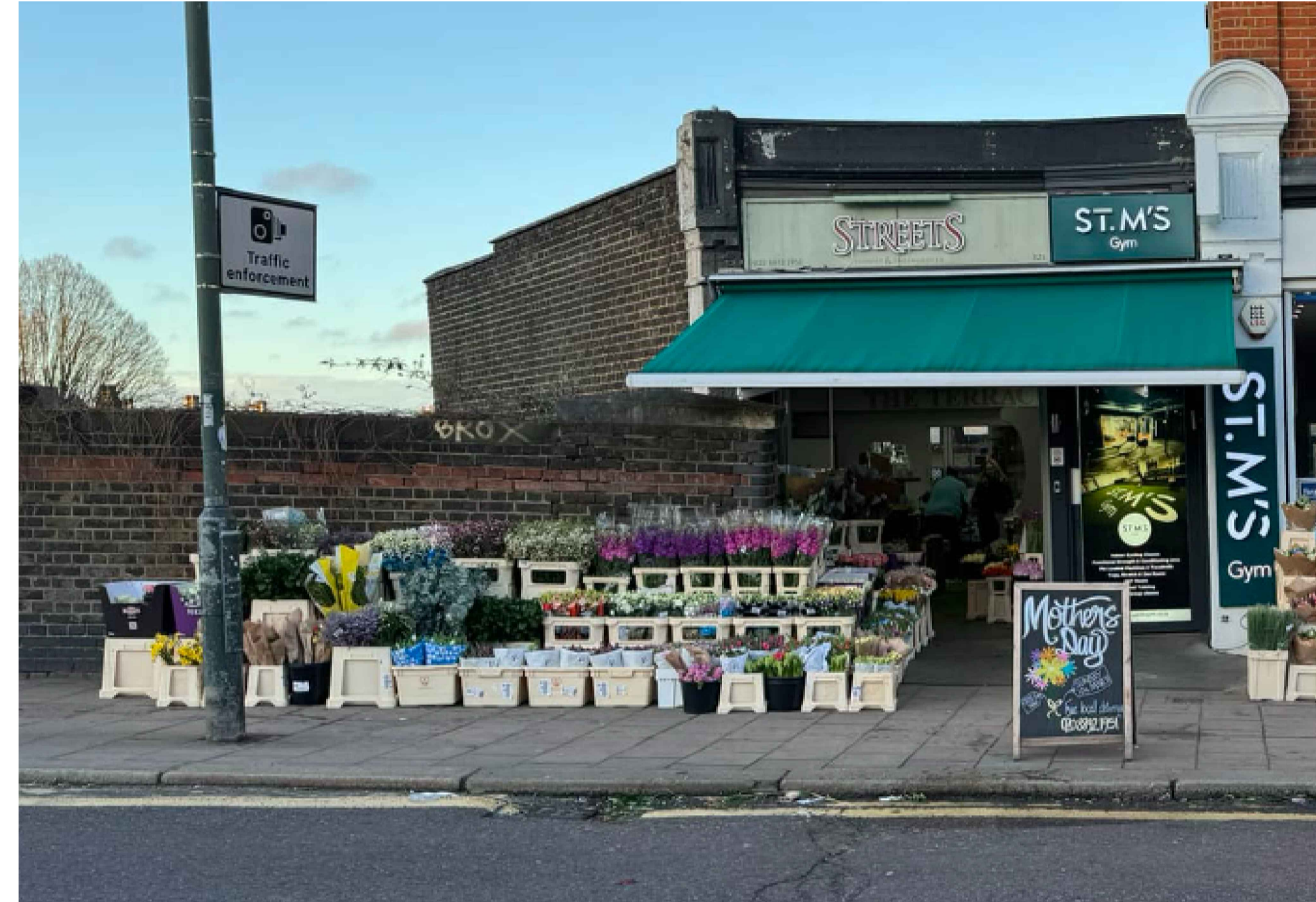
EXISTING SHOPFRONT PHOTO FOR REFERENCE