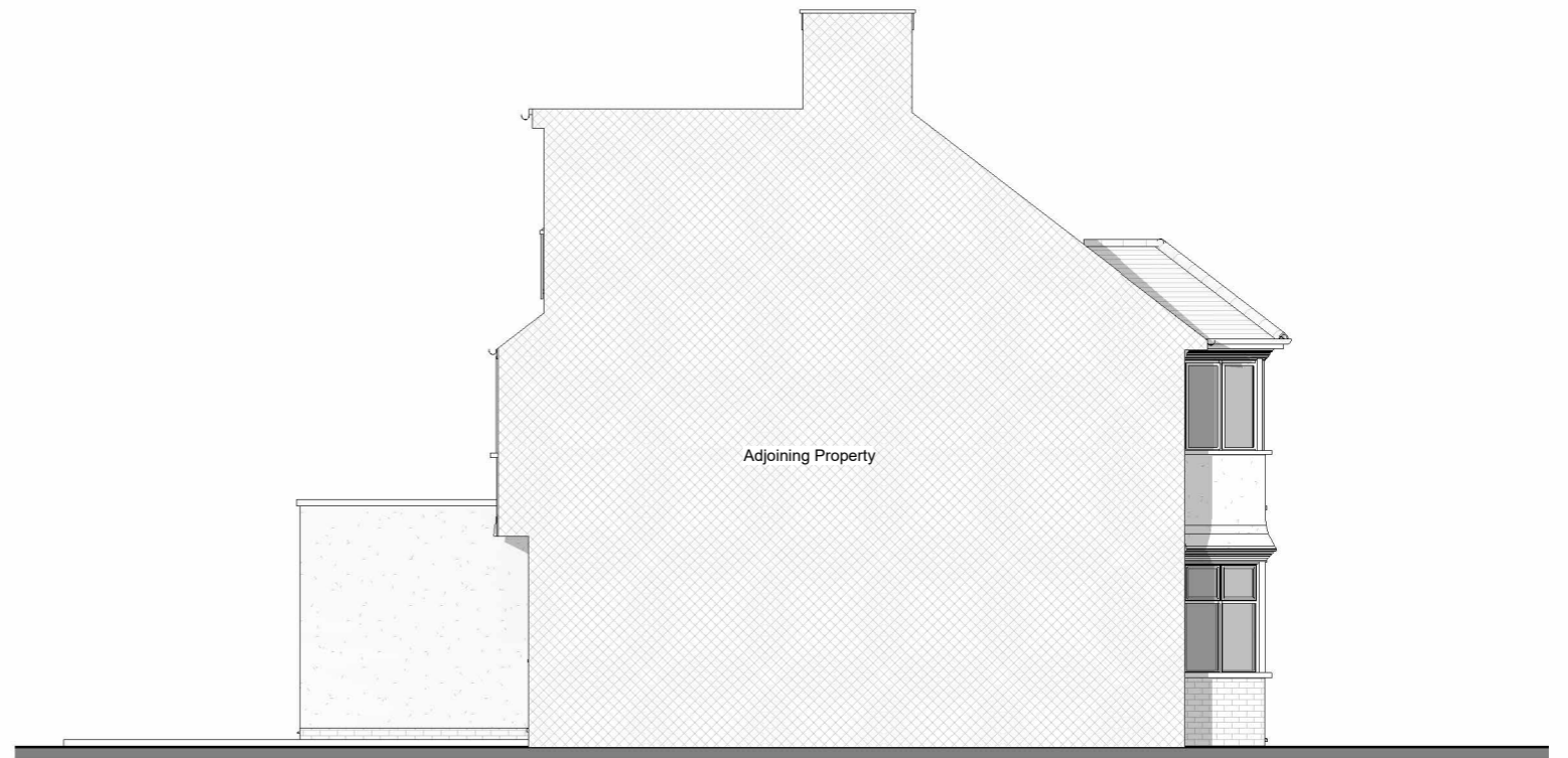
Side 1 Elevation