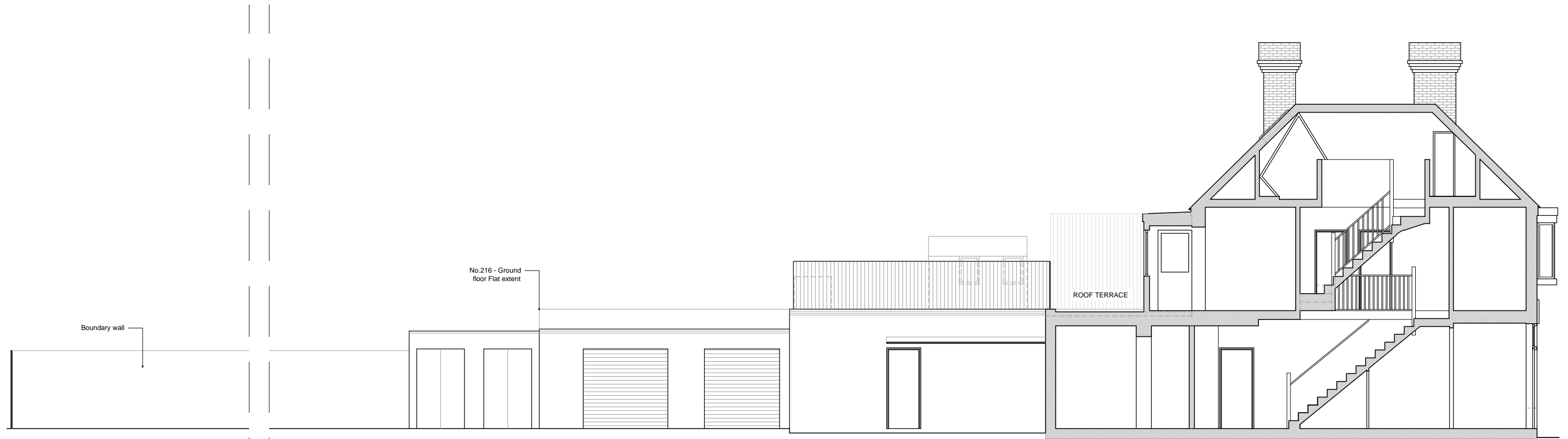
Side Elevation & Section A