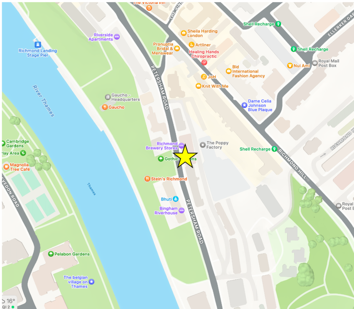
Figure 3-1 Site Location and Local Transport Network

This section provides a description of the existing highway network surrounding the site, and considers the accessibility of the site by non-car modes of transport, including on foot, bicycle and public transport. The site location and local highway network are shown in Figure 3-1.