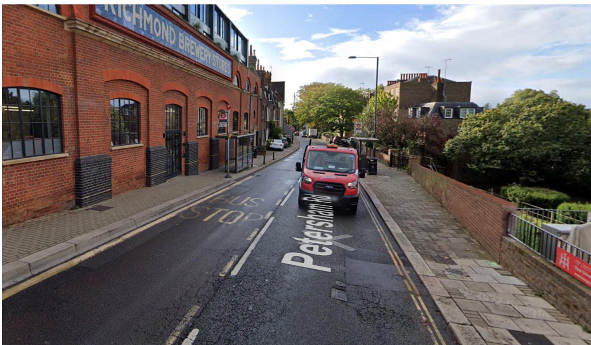
Figure 3-2 View towards site on left hand side

An image of the site towards the site, showing the adjacent highway network, is shown in Figure 3-2.