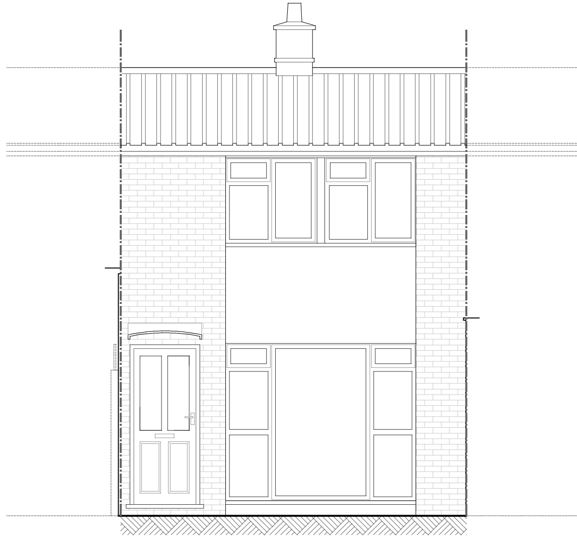
FRONT (WEST) ELEVATION