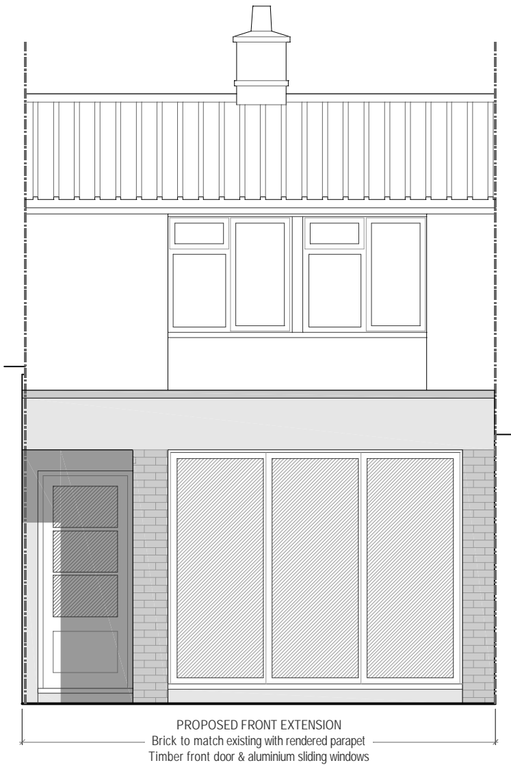
FRONT (WEST) ELEVATION