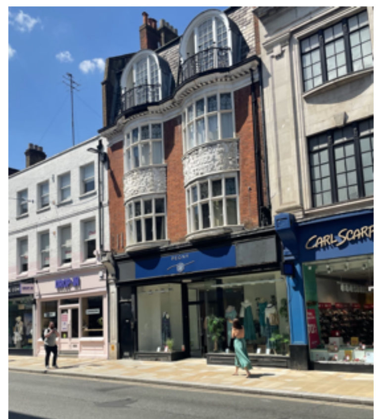
EXISTING SHOP FRONT ELEVATION