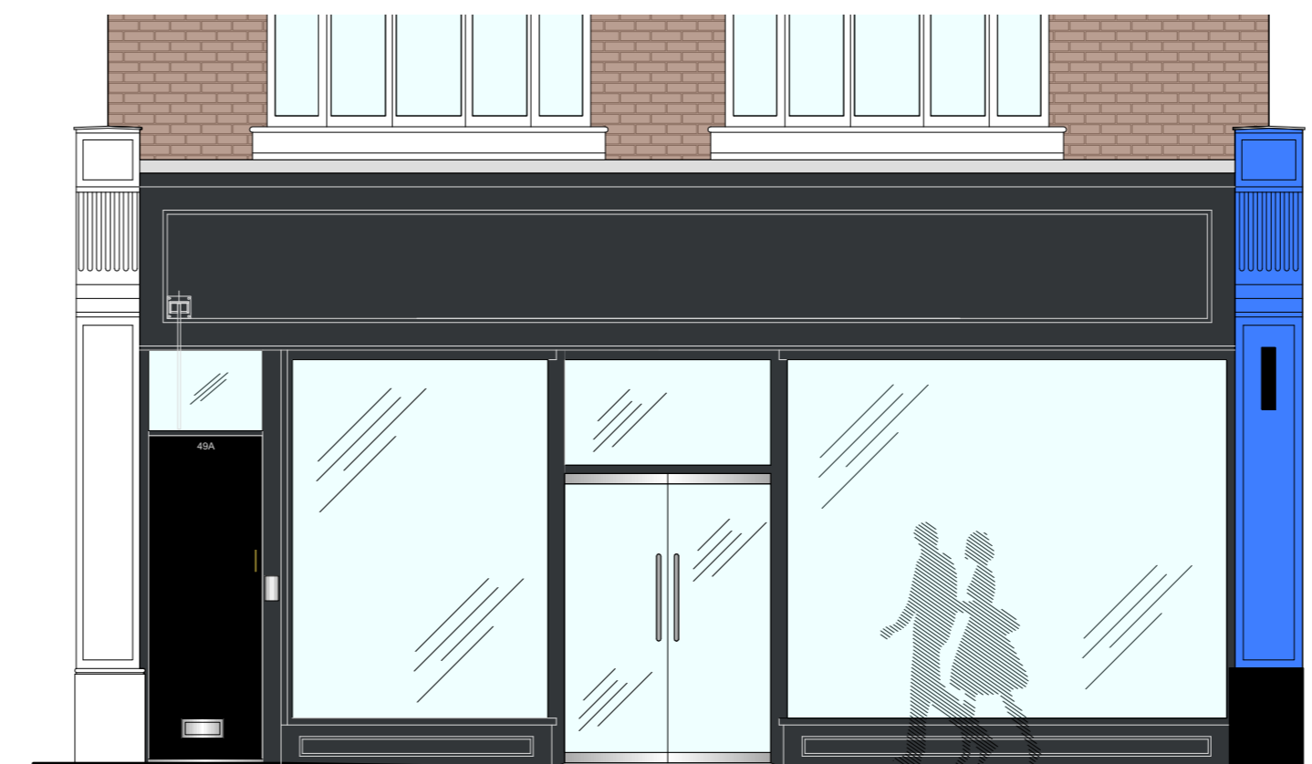
EXISTING SHOP FRONT ELEVATION Scale: 1:50