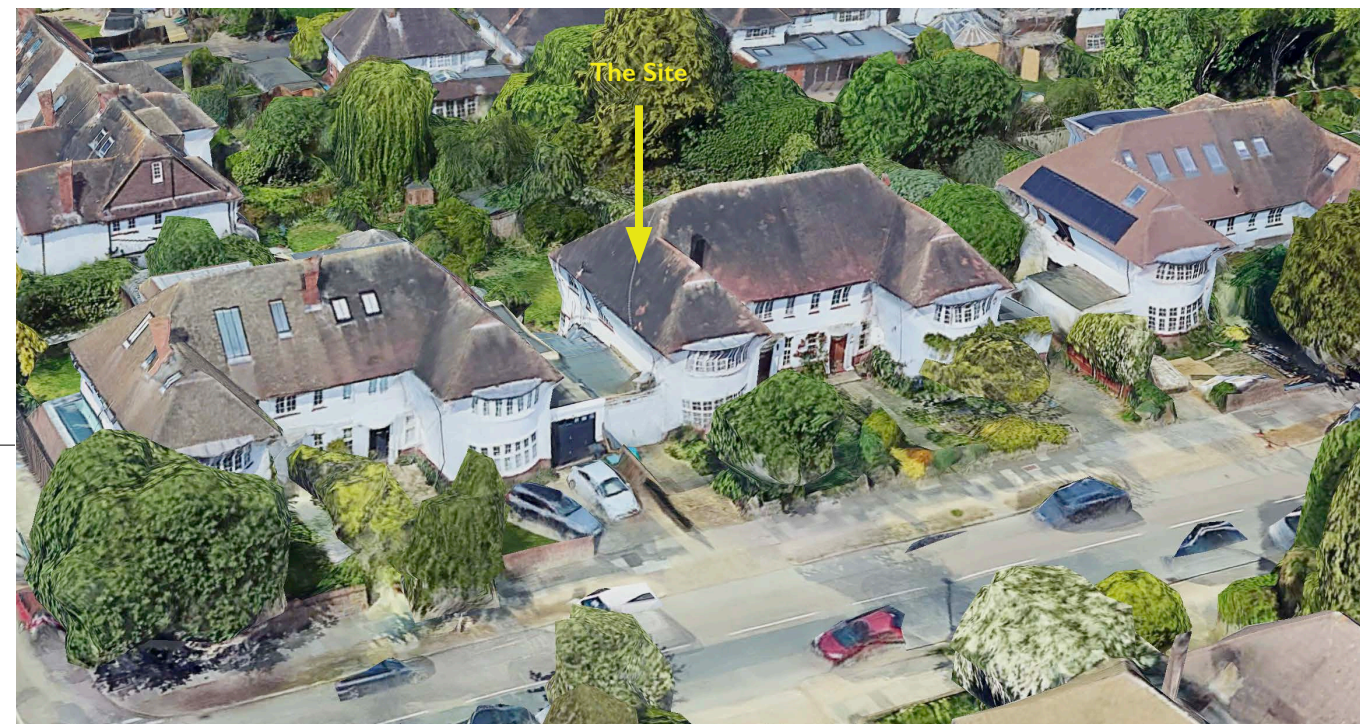
Google Earth view of the location