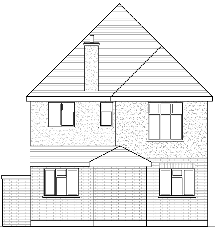
EXISTING REAR ELEVATION C SCALE 1:100 MTS