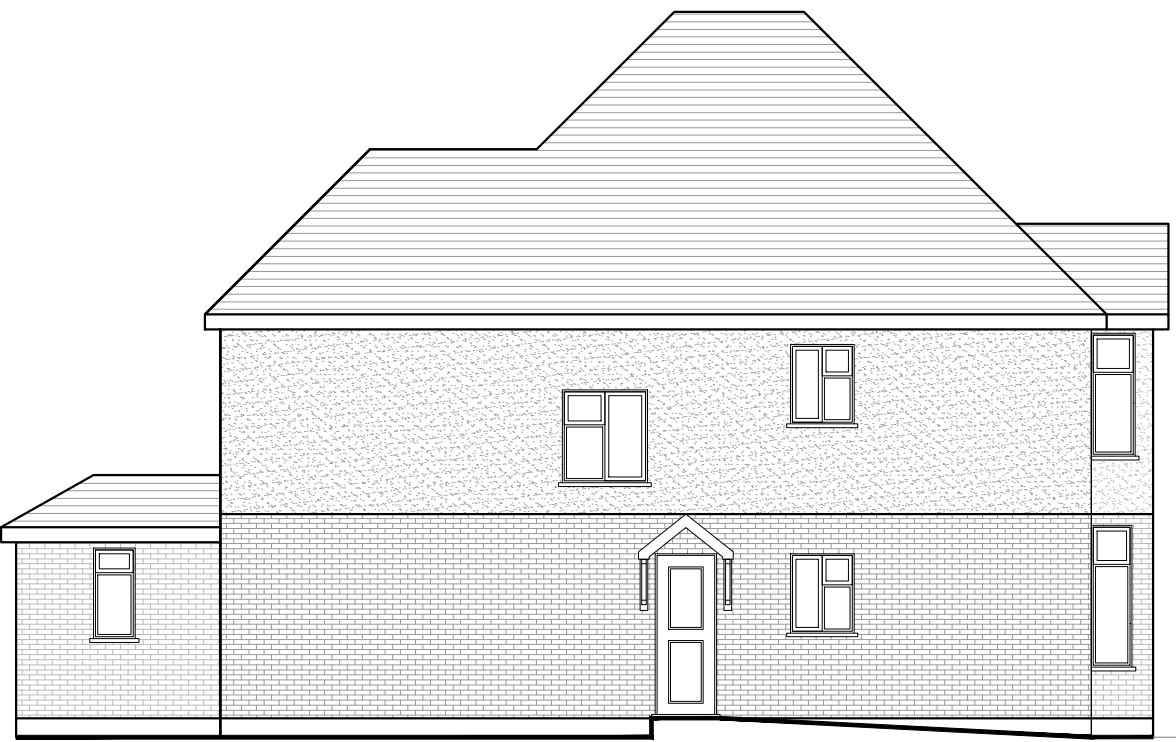
EXISTING LEFT SIDE ELEVATION D SCALE 1:100 MTS