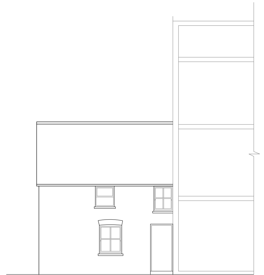
SIDE ELEVATION/PART SECTION