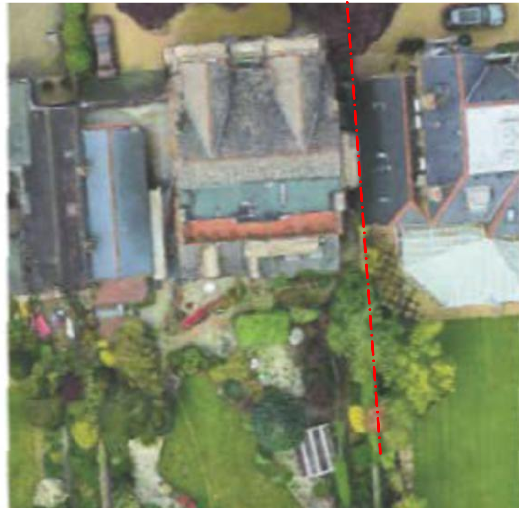
PLAN PHOTO OF BOTH EXISTING PROPERTIES.