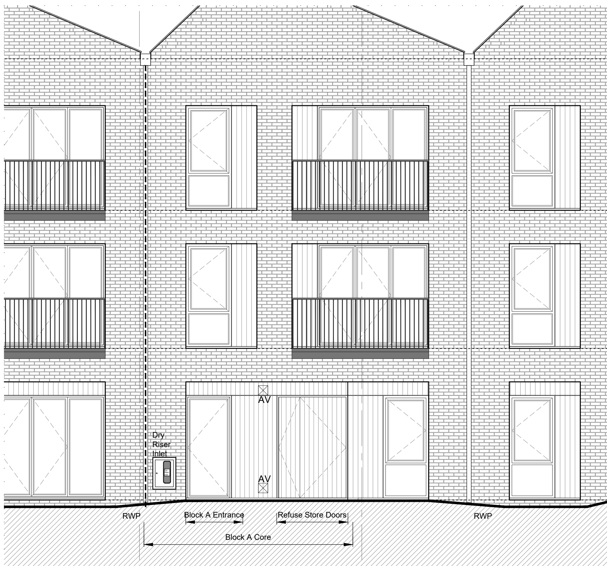
Extract of Block A & F East Elevation showing Block A Refuse Store Entrance

This drawing has been produced pursuant to the submission in relation to the discharge Conditions U0178995 / U0178996 / U0178995 of Planning Consent 22/2556/FUL.