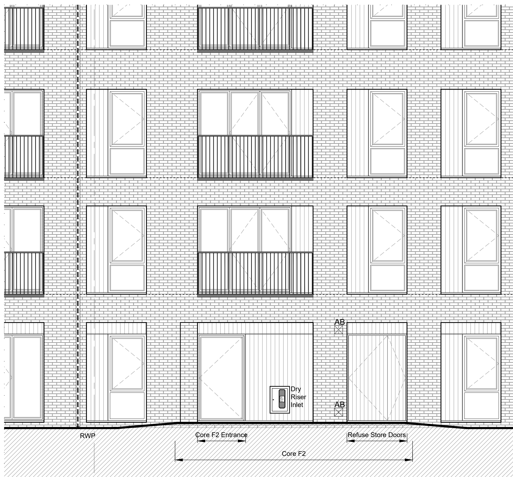
Extract of Block A & F West Elevation showing Block F Core 2 Refuse Store Entrance