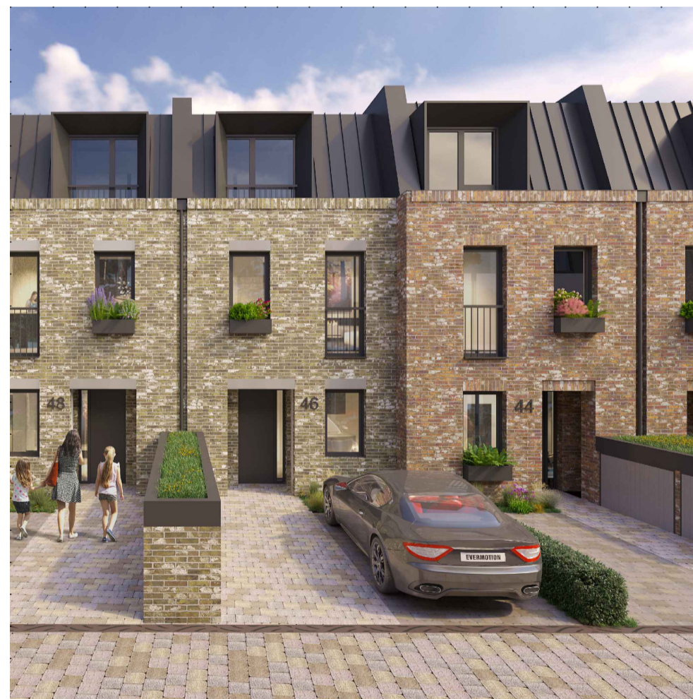
Planning CGI showing design intent for external Cycle & Refuse Stores