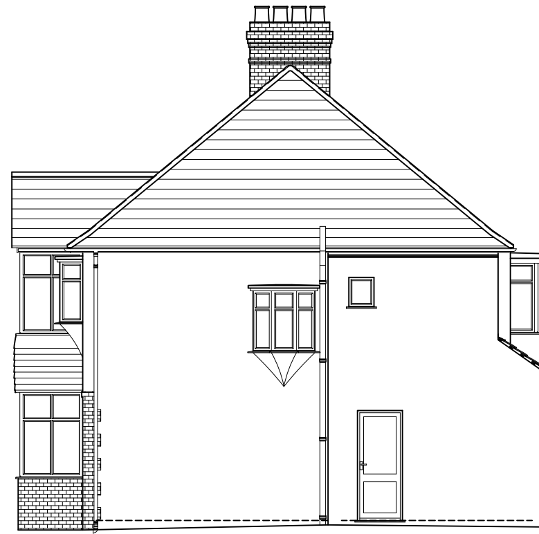
EXISTING RIGHT SIDE ELEVATION