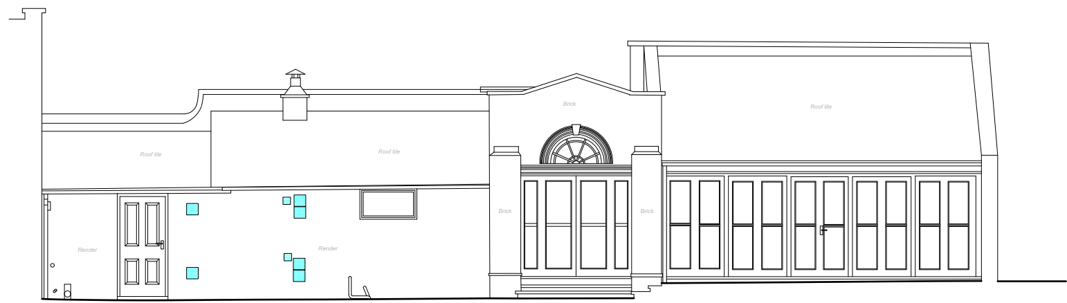
Pool House Elevation

16.000 15.000 14.000 13.000 12.000 11.000 10.000 9.000 8.000 7.000 6.000 ELEVATION 5