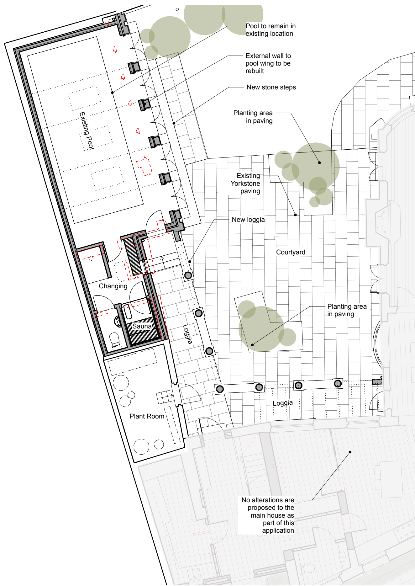
Ground Floor Plan - Pool Wing