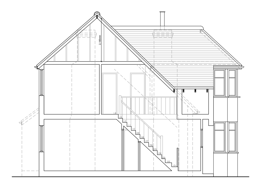
EXISTING SECTION A - A