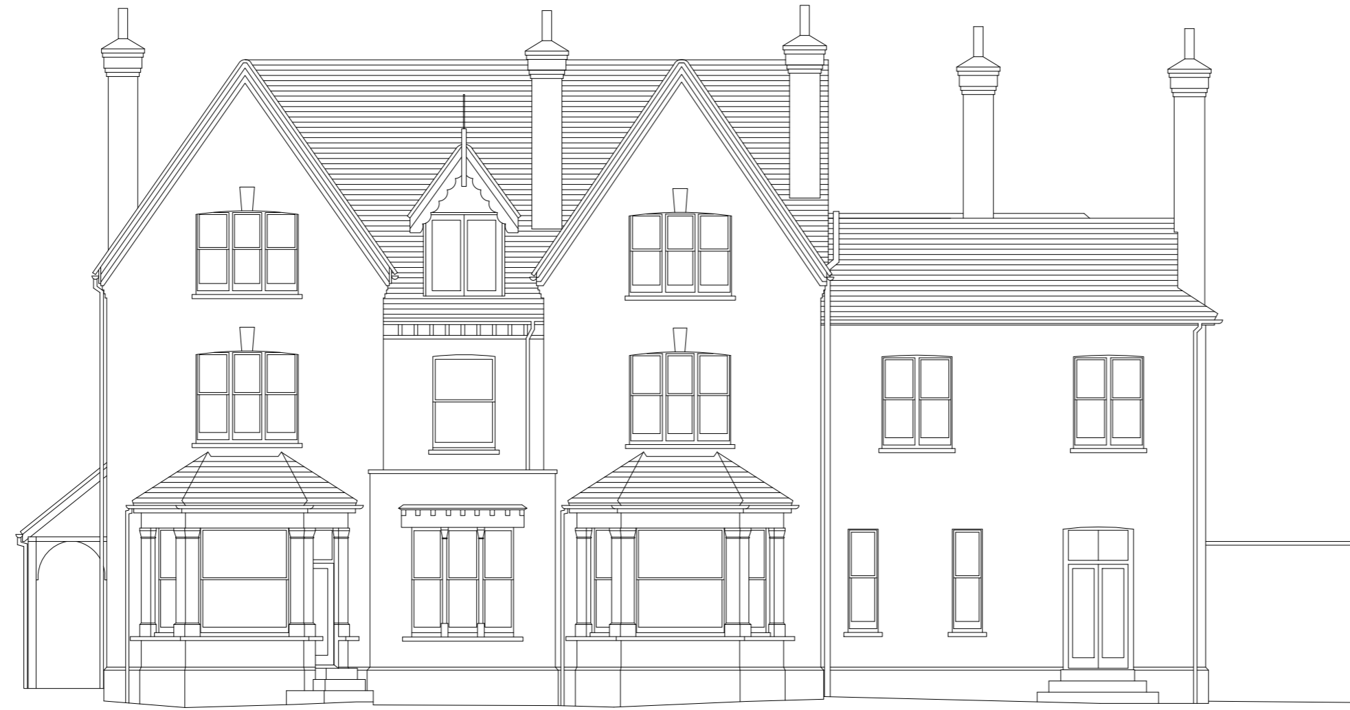
ELE 1 SOUTH ELEVATION Scale: 1:100 @ A2