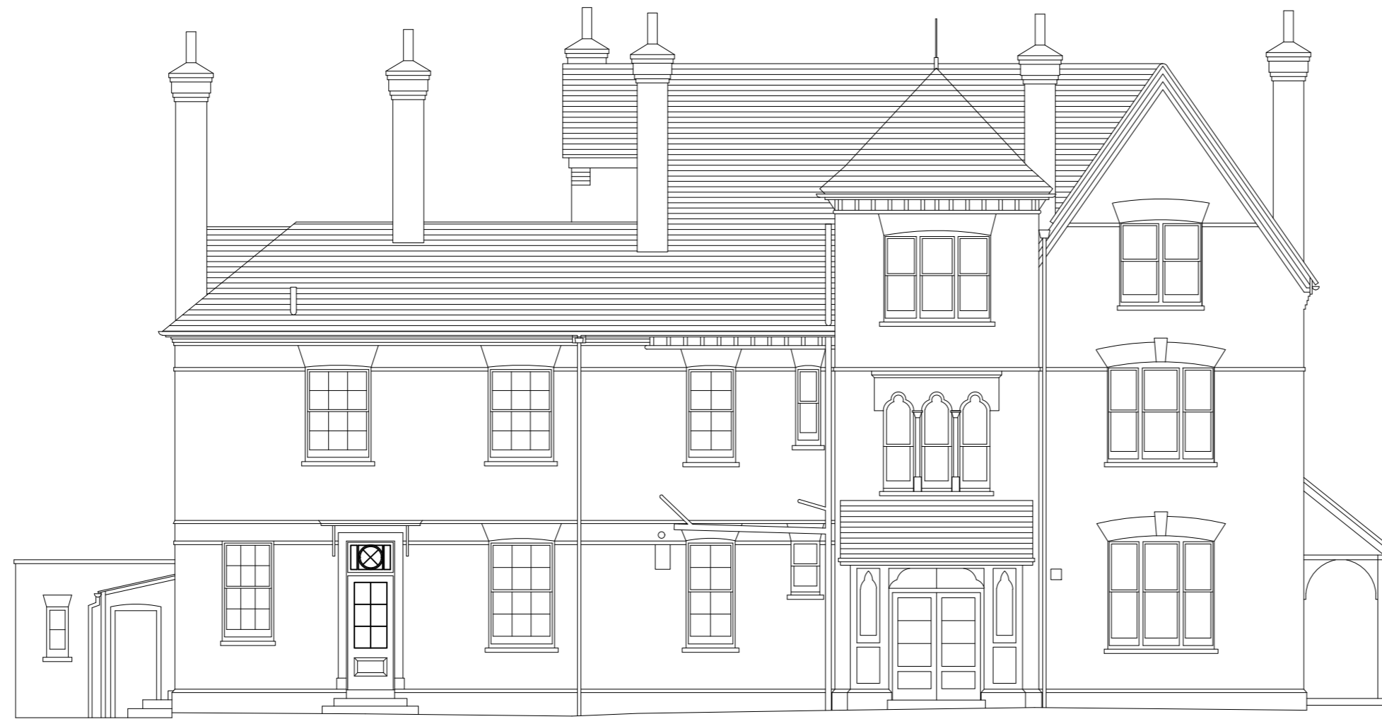
ELE 3 NORTH ELEVATION Scale: 1:100 @ A2