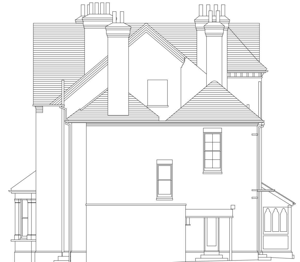
ELE 4 EAST ELEVATION Scale: 1:100 @ A2