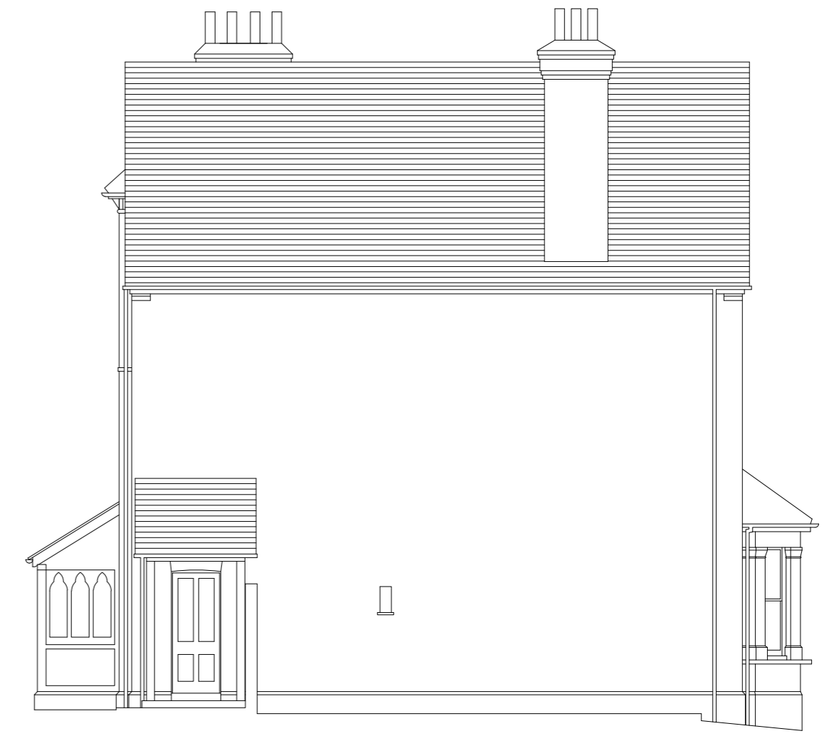
ELE 2 WEST ELEVATION Scale: 1:100 @ A2