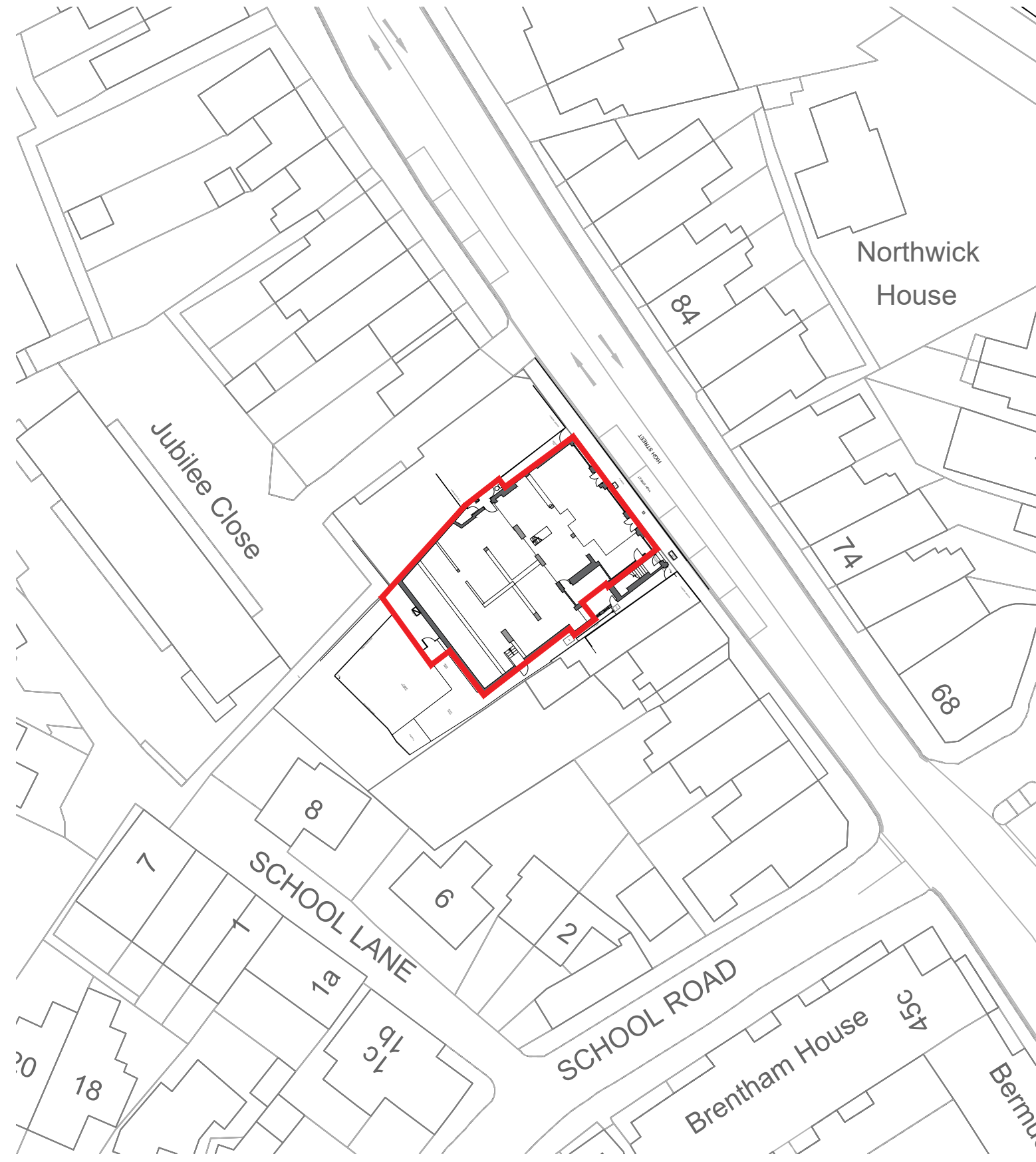
02 BLOCK PLAN 1:500