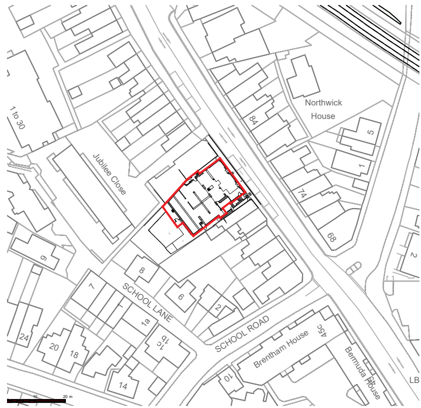
01 LOCATION PLAN 1:1250