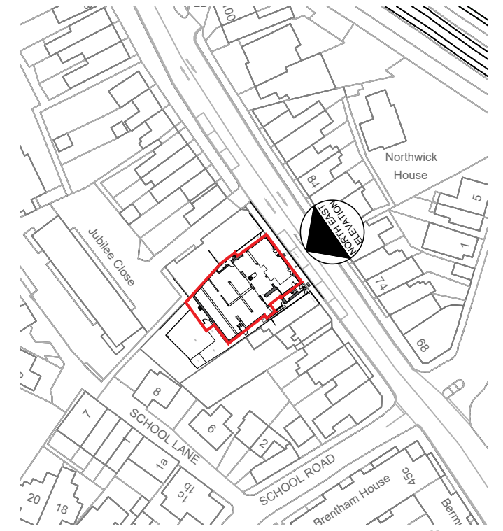
03 GROUND FLOOR KEY PLAN NTS