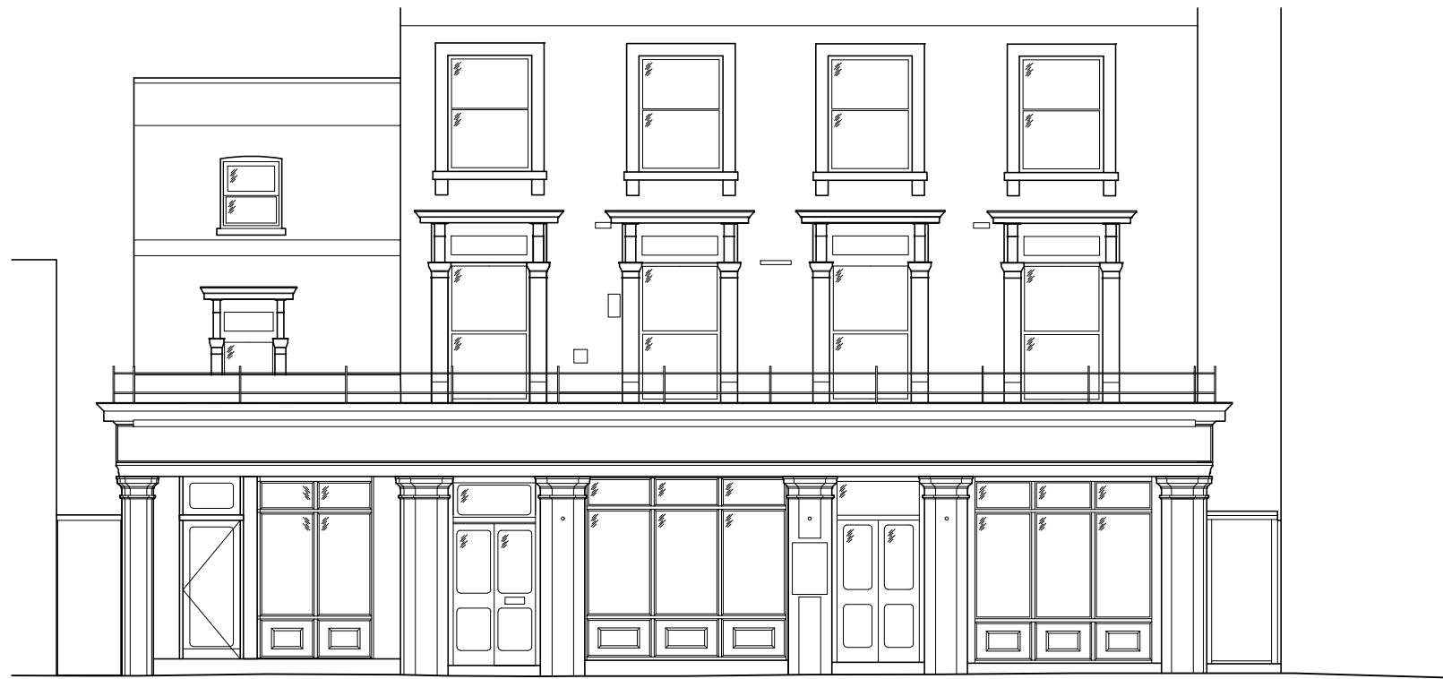
01 EXISTING NORTH EAST ELEVATION 1:100@A3

DO NOT SCALE FROM THIS DRAWING - STATED DIMENSIONS REFER. CONTRACTORS SHALL BE RESPONSIBLE FOR THE CHECKING OF ALL STATED DIMENSIONS, WITH ANY ANOMALIES BEING IDENTIFIED TO THE ORIGINATOR PRIOR TO ANY CONSTRUCTION OR FABRICATION WORKS COMMENCING.