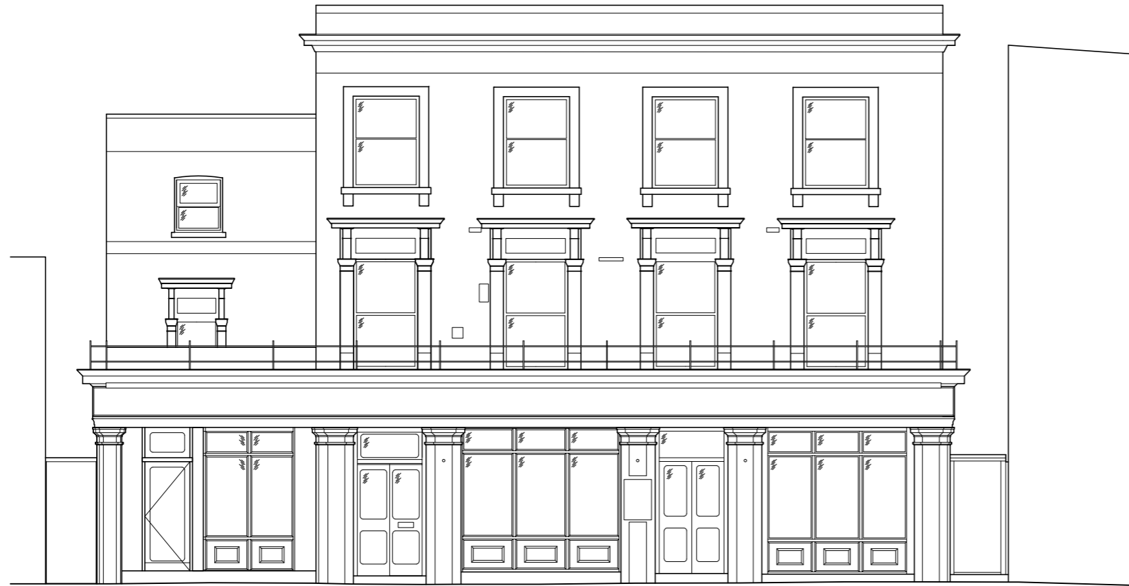
01 EXISTING NORTH EAST ELEVATION 118165 220 1:100@A3