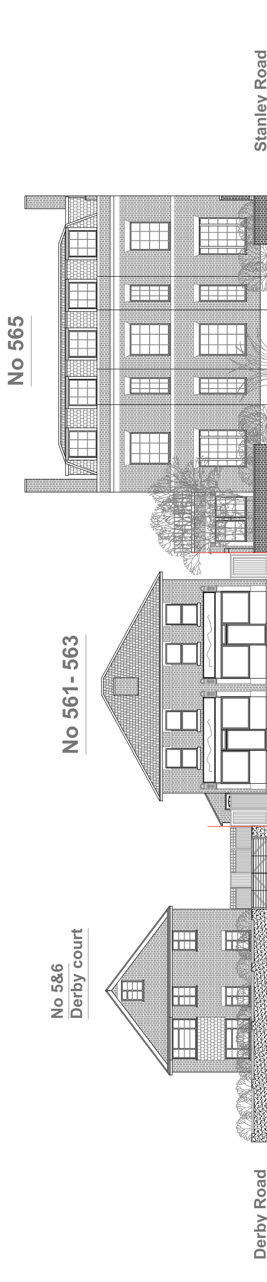
Existing Street Elevation Scale:1:200