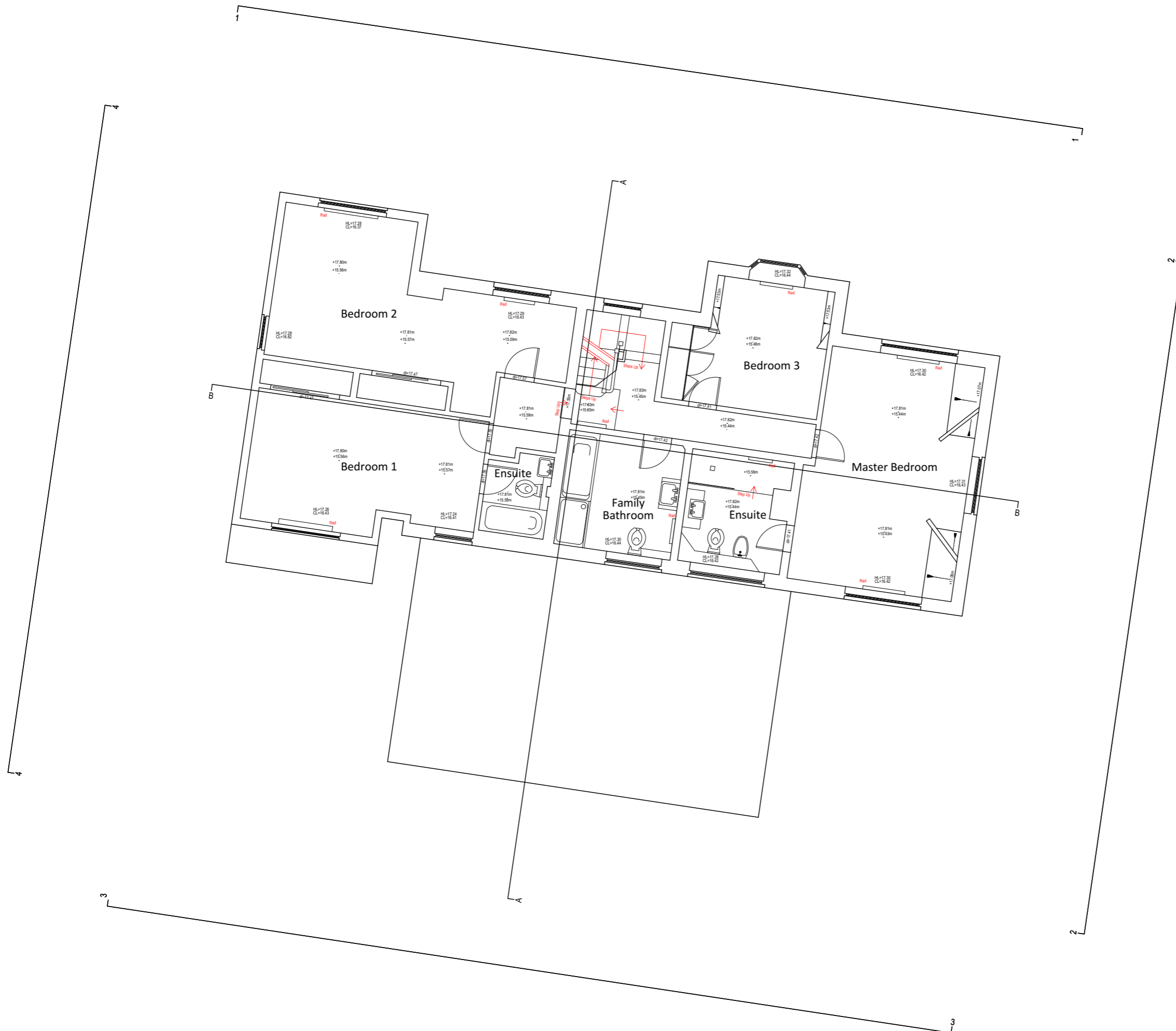
Existing First Floor Plan 1:100