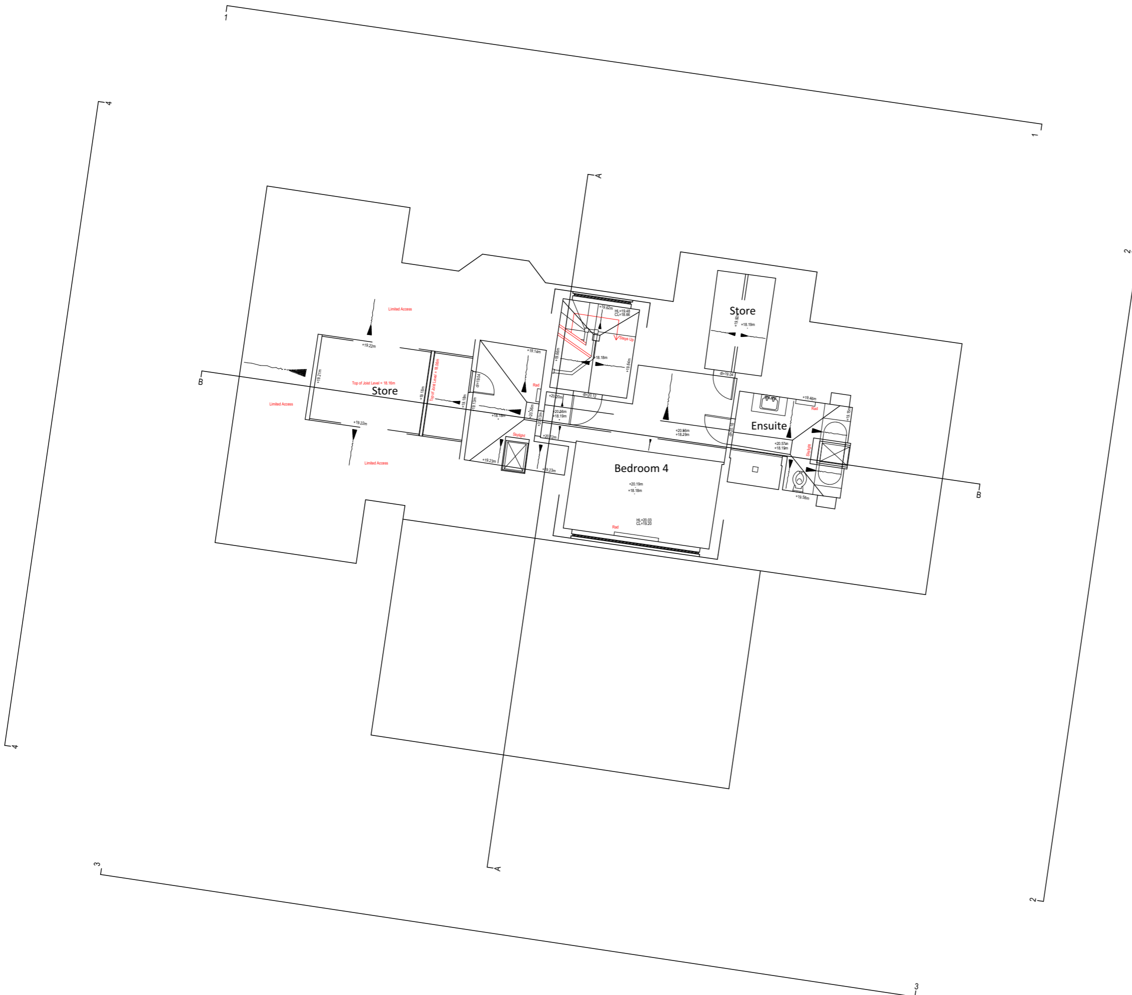
Existing Second Floor Plan 1:100