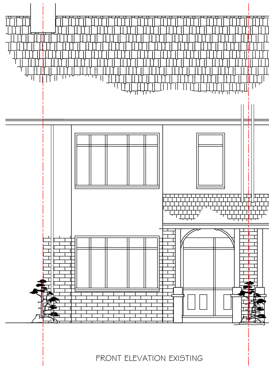
FRONT ELEVATION EXISTING