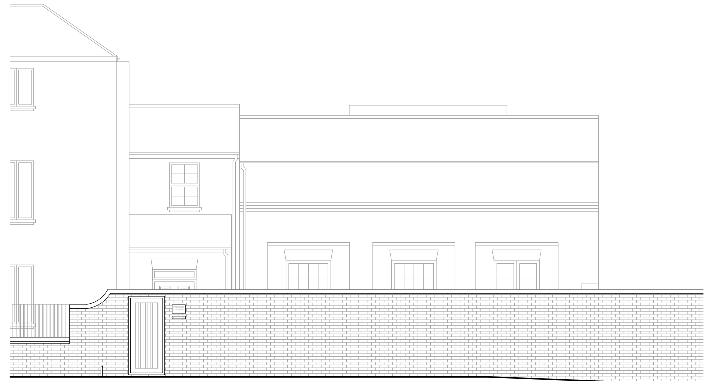
02 Existing Boundary Wall Elevation 1:100 @ A3