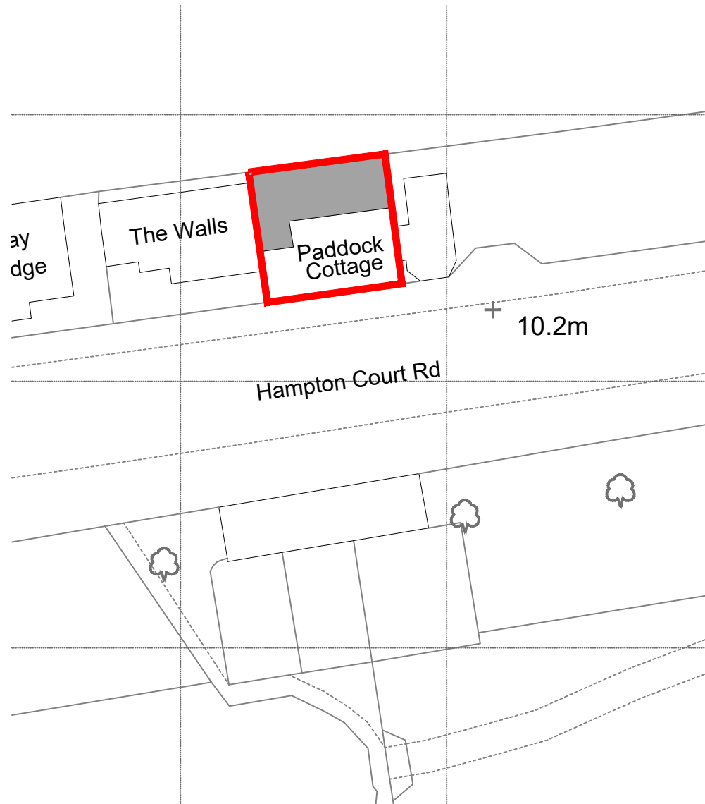
02 Existing Site Plan 1:500 @ A3