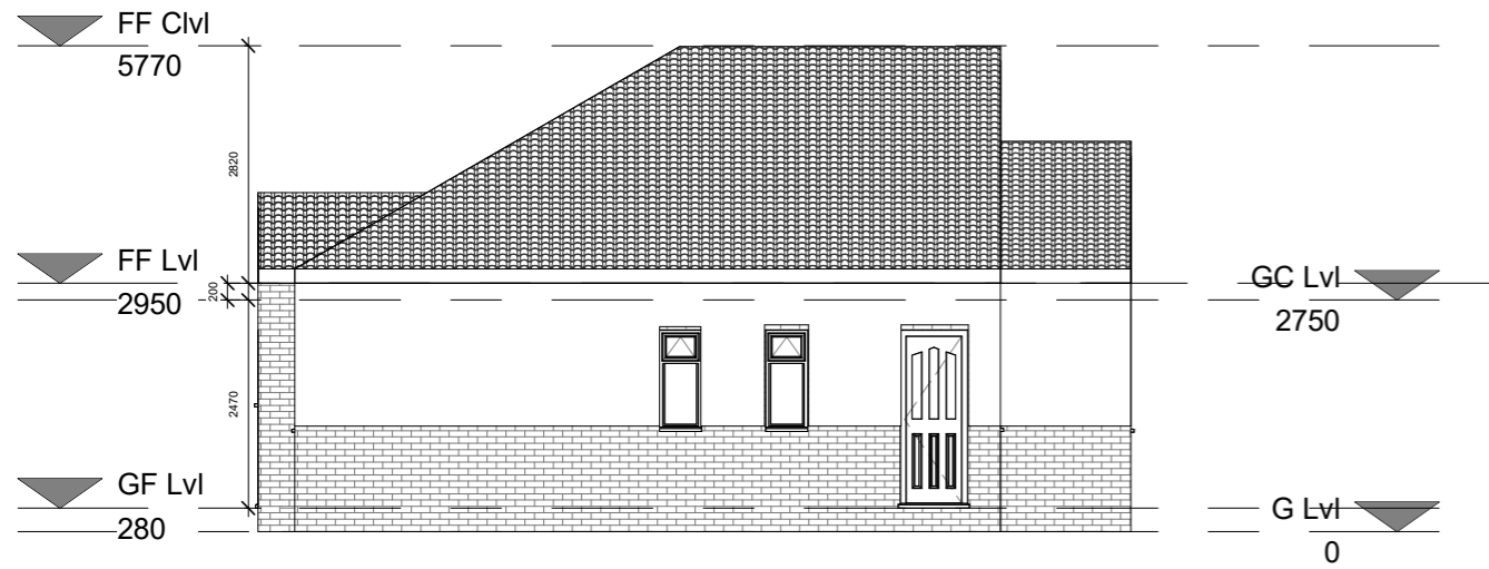
RH ELEVATION 1 : 100